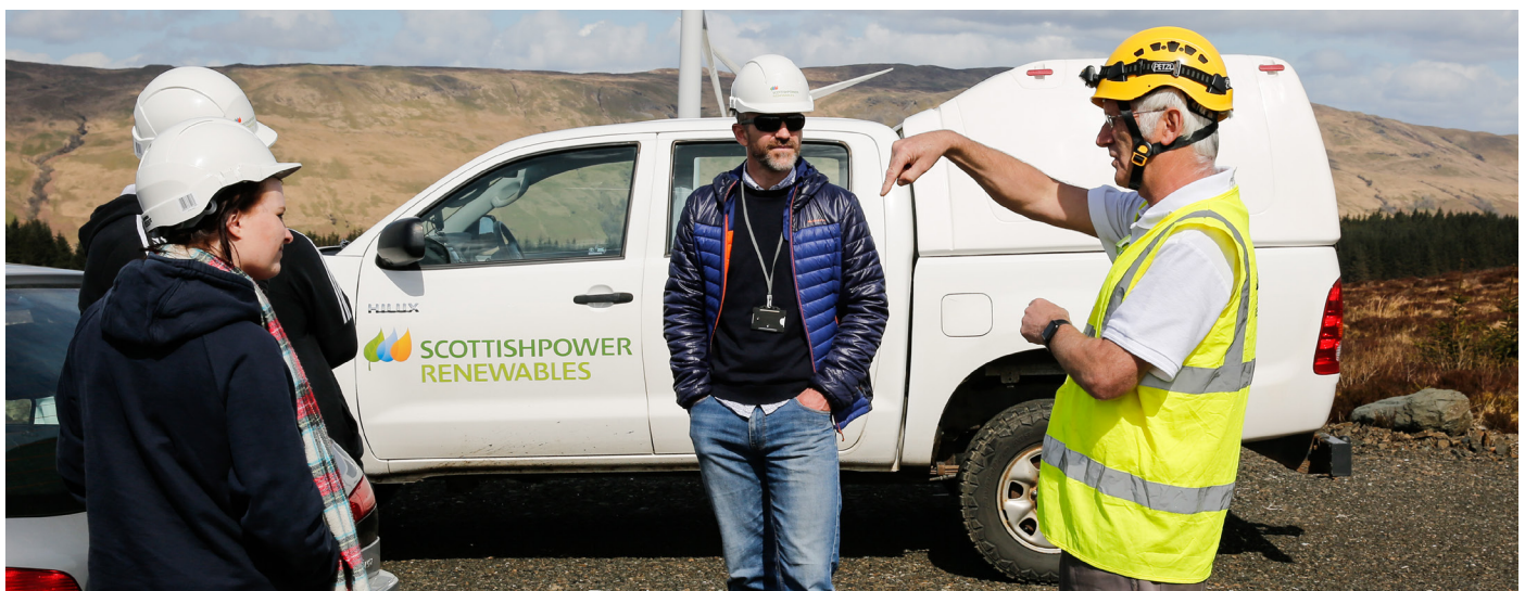
The HELP Project visit Cruach Mhor Windfarm