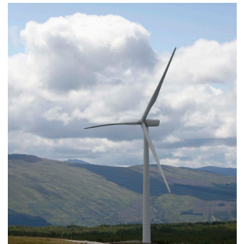
Clachan Flats Windfarm

As the UK's leading onshore wind developer with windfarms in Argyll & Bute, we are keen to be good neighbours and maximise the local benefits that we create. We are proud that, to date, we have voluntarily contributed more than £19,250,000 in community benefit to enable local communities to deliver initiatives across the UK.