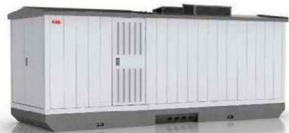
TYPICAL INVERTOR SUBSTATION ABB PYS800-MWS