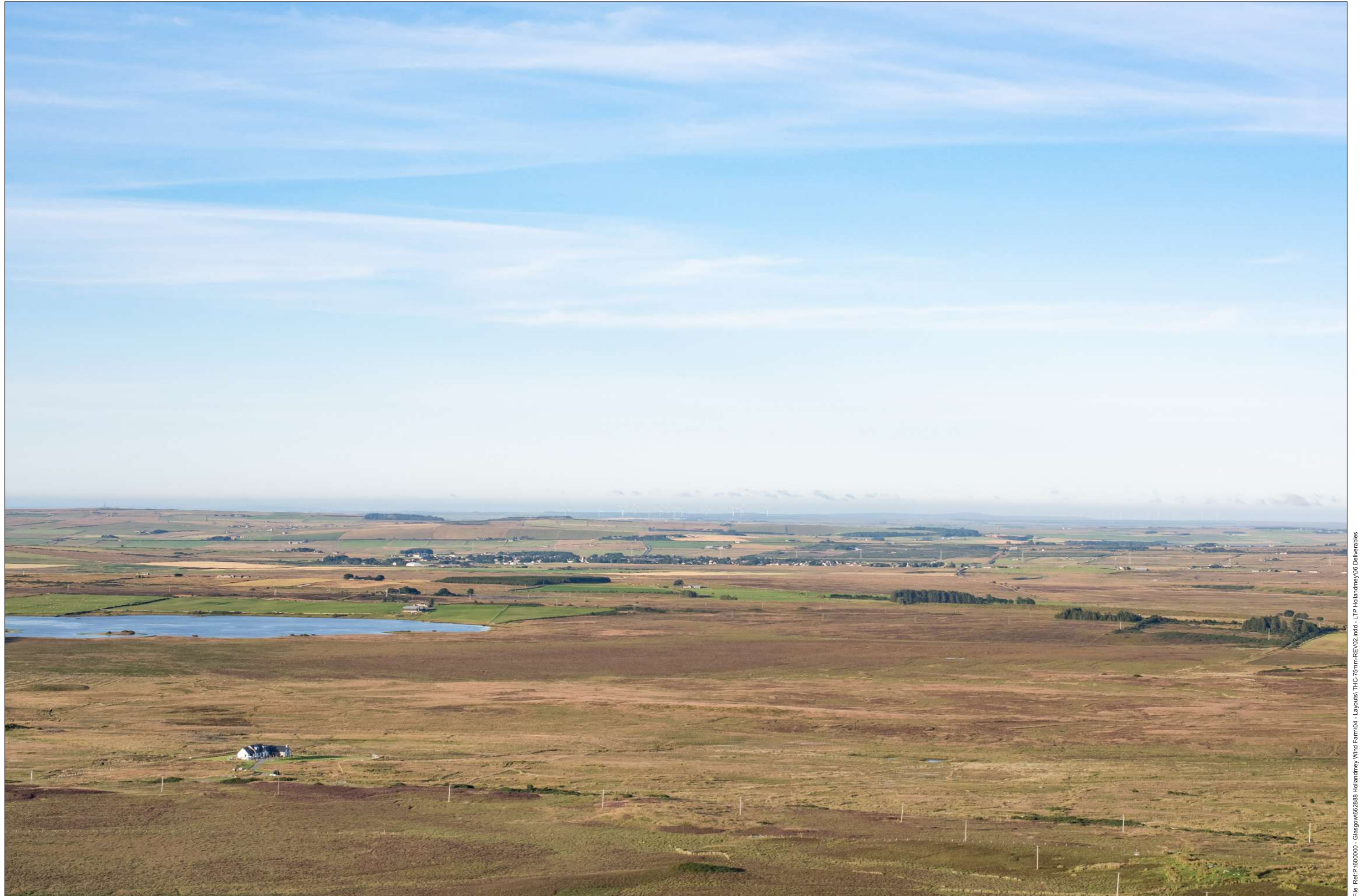
Figure: 7.28-THC-04 Viewpoint 15: Ben Dorrery

This image should be viewed at a comfortable arm's length (Approx. 500 mm)