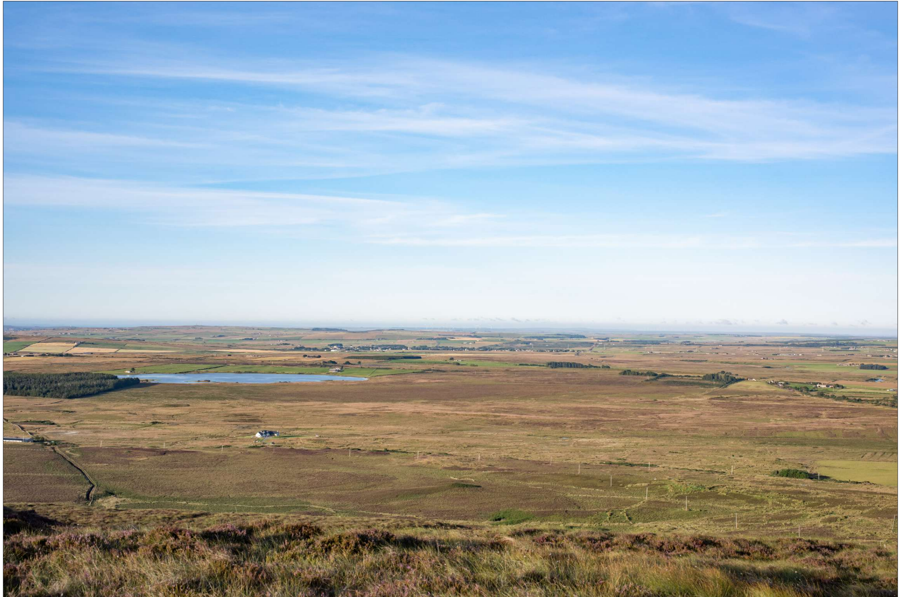
Figure: 7.28-THC-03 Viewpoint 15: Ben Dorrery

When viewed at a comfortable arm's length (approx. 500 mm), this printed image is representative of our detailed central vision, but is not representative of scale and distance.