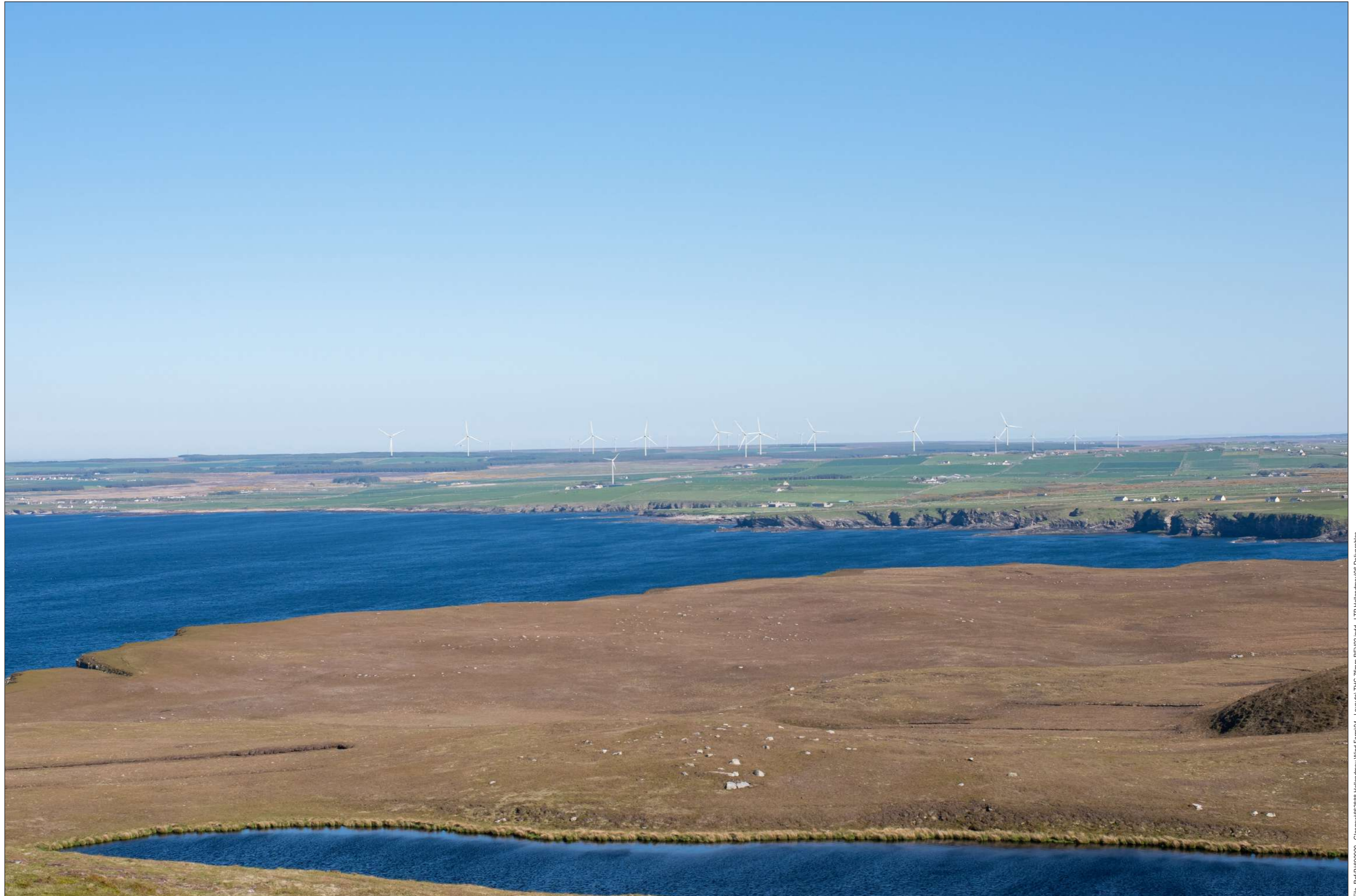
Figure: 7.17-THC-04 Viewpoint 4: Dunnet Head

This image should be viewed at a comfortable arm's length (Approx. 500 mm)