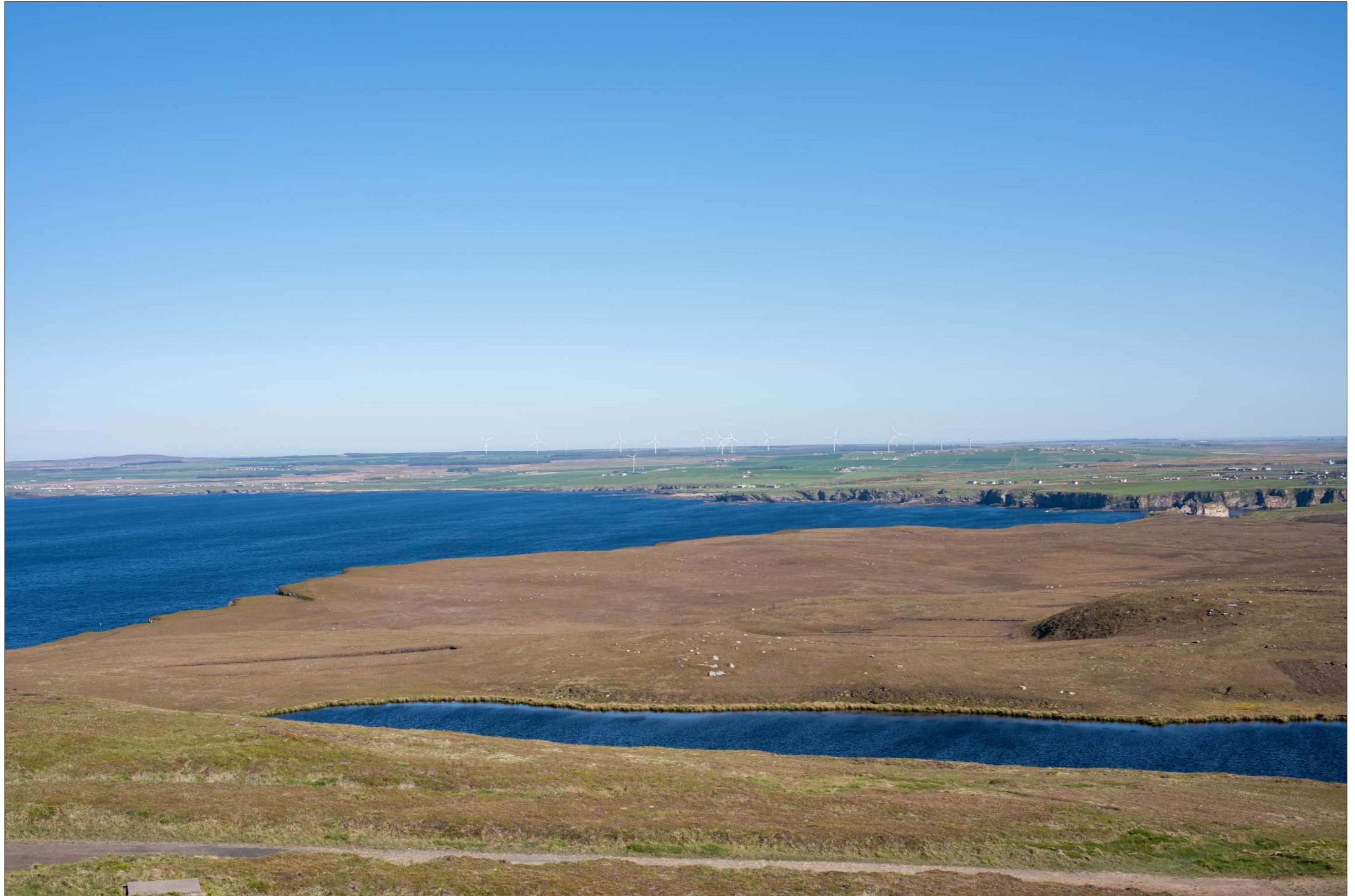
Figure: 7.17-THC-03 Viewpoint 4: Dunnet Head

When viewed at a comfortable arm's length (approx. 500 mm), this printed image is representative of our detailed central vision, but is not representative of scale and distance.