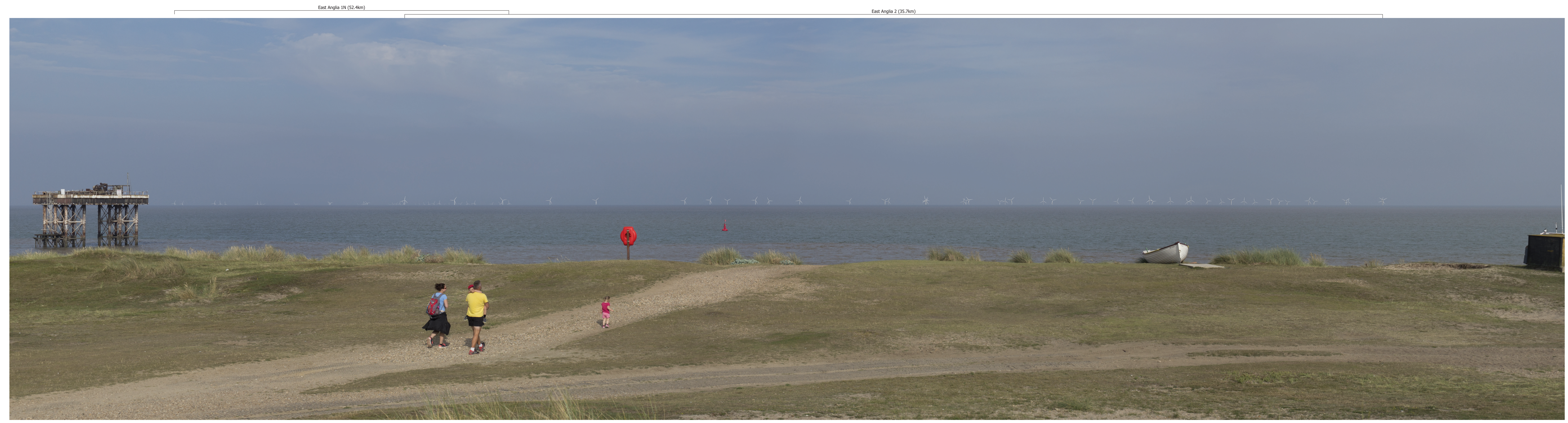
Photomontage view from Sizewell Beach showing EA1N and EA2 15/19MW turbine layouts.