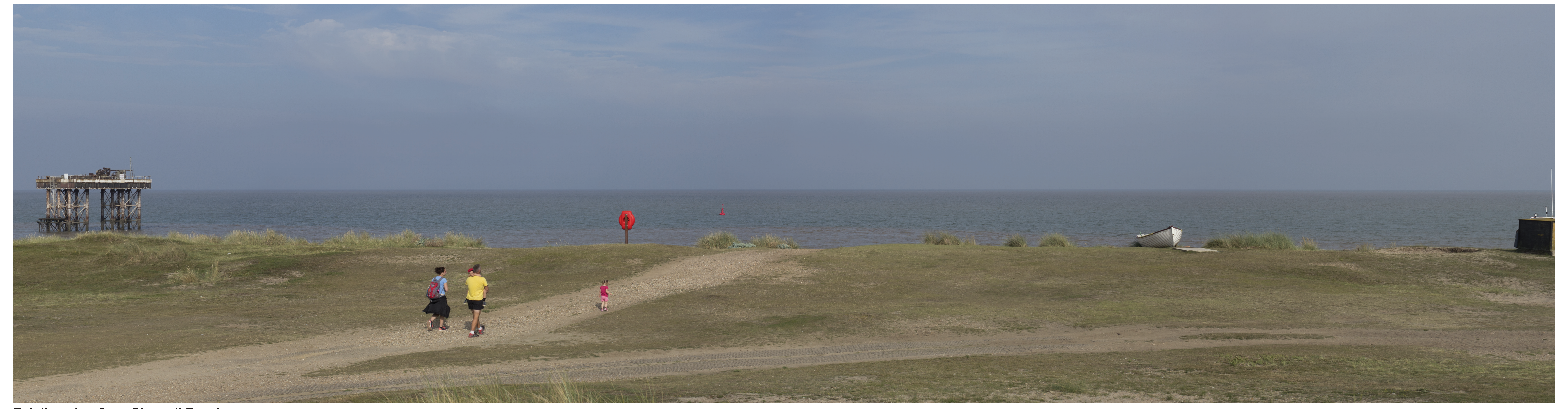
Existing view from Sizewell Beach.