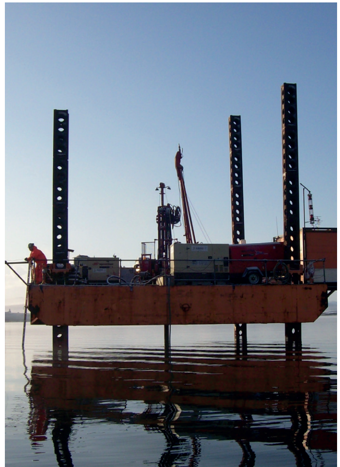
A vessel similar to this jack-up barge, with drilling equipment on board, will be used in the Deben Estuary.

The jack-up or specialist vessel will be towed or moved to each location (Martlesham Creek, Deben Estuary and the landfill) and will remain in that place, including overnight, until the works have been completed. The vessel