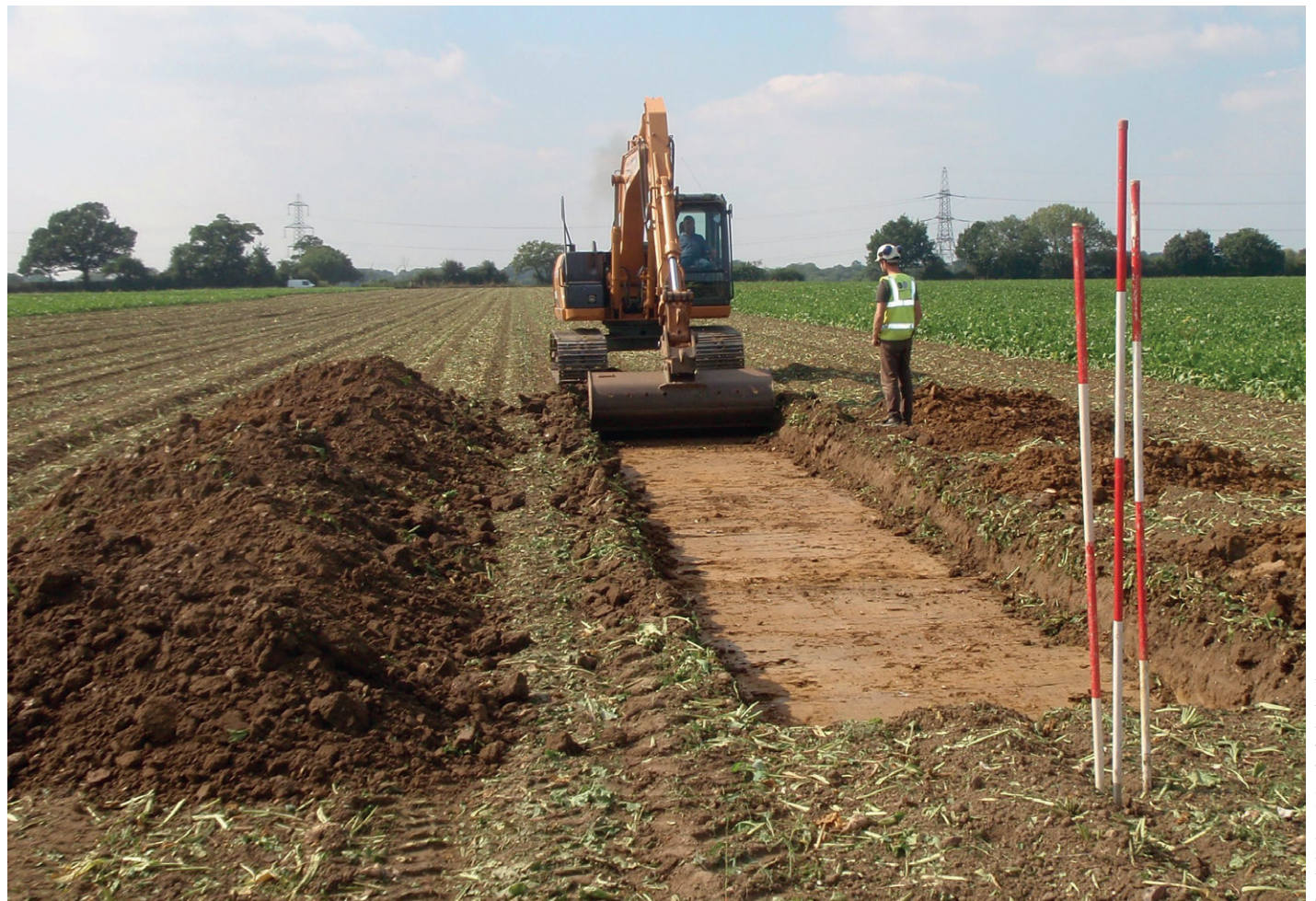
An excavator digging a trial trench.

As with the geophysical works, the equipment for this survey will be transported on a trolley towed by a Land Rover or similar-sized truck.