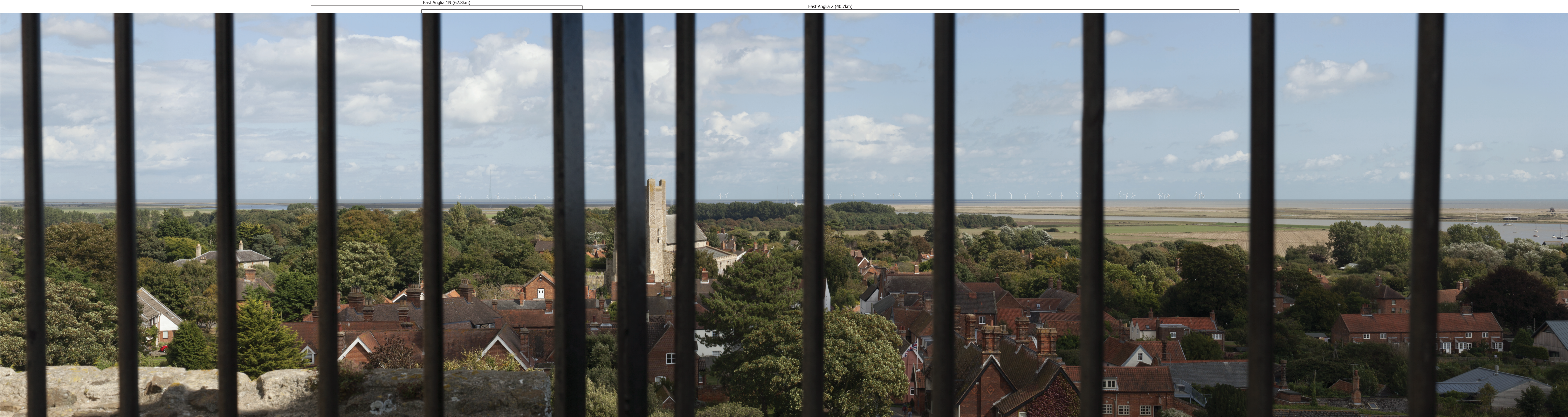
Photomontage view from Orford Castle showing EA1N and EA2 15/19MW turbine layouts.