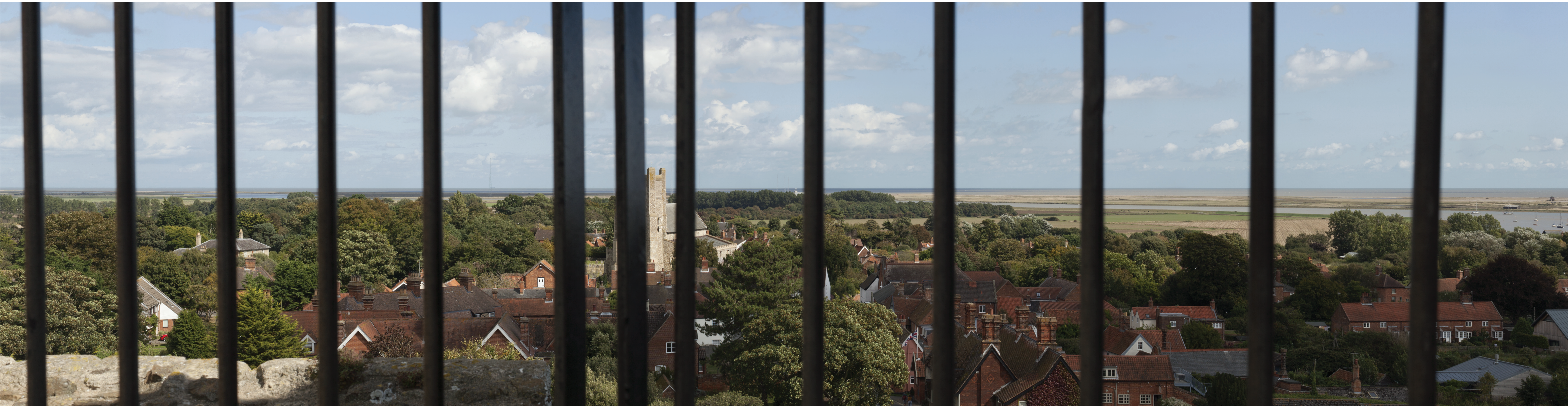
Existing view from Orford Castle.

Viewing instructions These visualisations are designed to be printed at the paper size identified and viewed at a comfortable arm's length. Hard copies of these visualisations, printed at the right size and high print quality are the best way of viewing the images. It is preferable to view printed images rather than view images on screen. If you do view images on screen you should do so using a normal PC screen with the image enlarged to the full screen height to give a realistic impression.