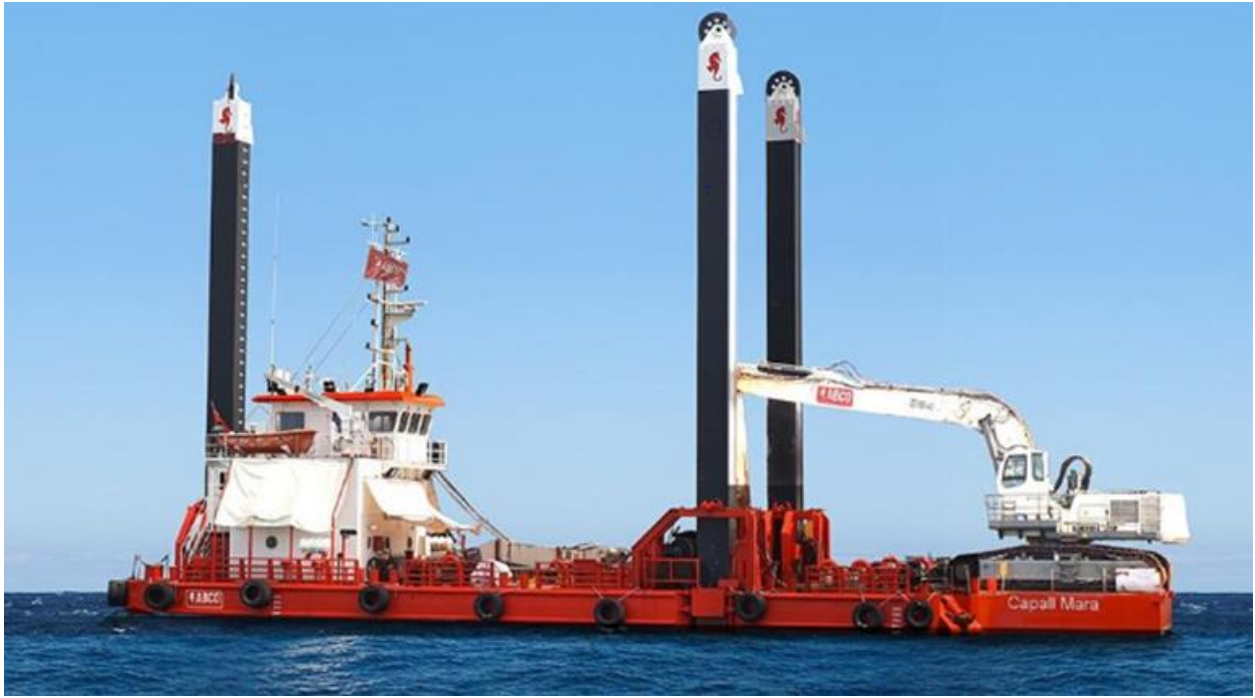
CAPALL MARA Call Sign MBSF3

The works will be undertaken by the Capall Mara and commence 25 th June 2018 the vessel will leave circa July 2018 with spoil being present for approximately two to three months.