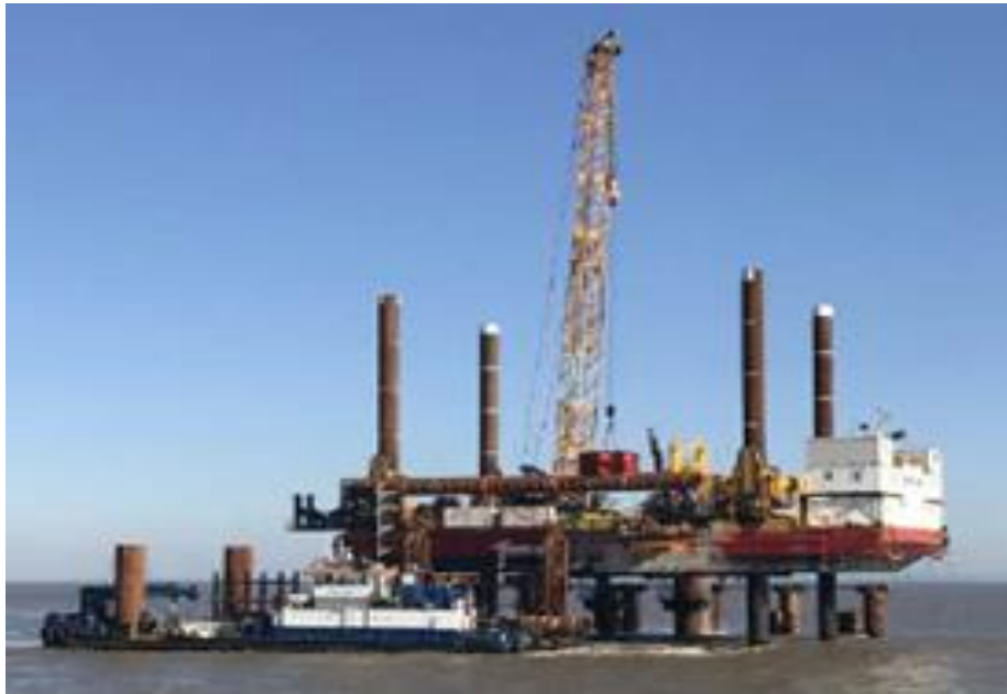
Fugro 1200 Jack Up Platform