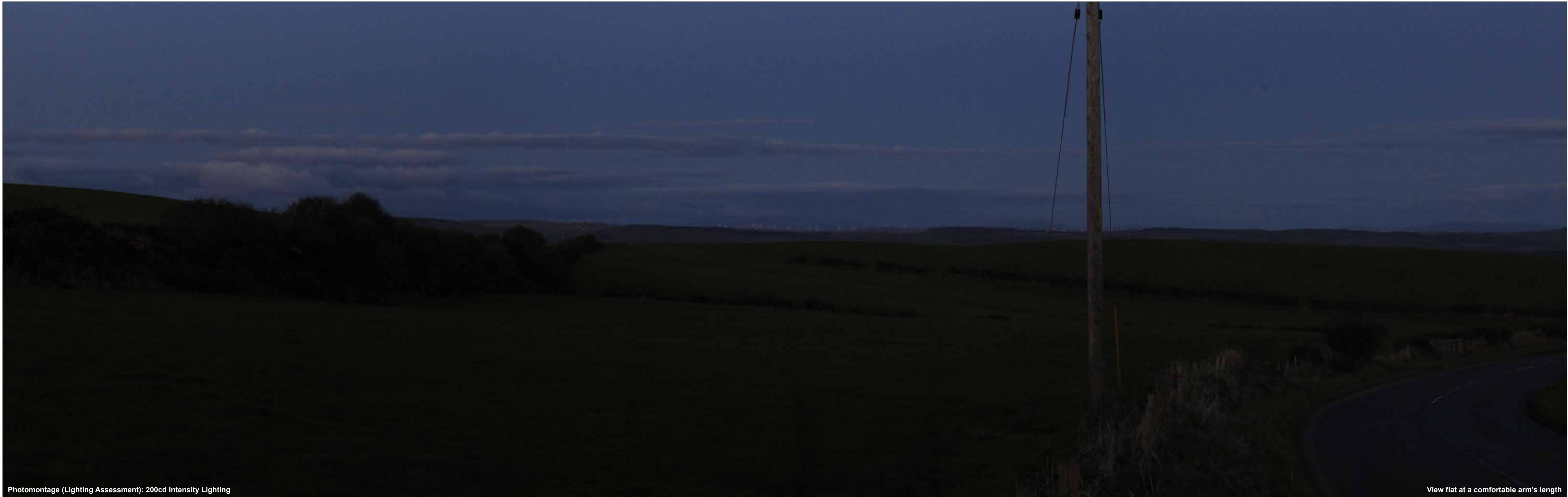
Photomontage (Lighting Assessment): 200cd Intensity Lighting