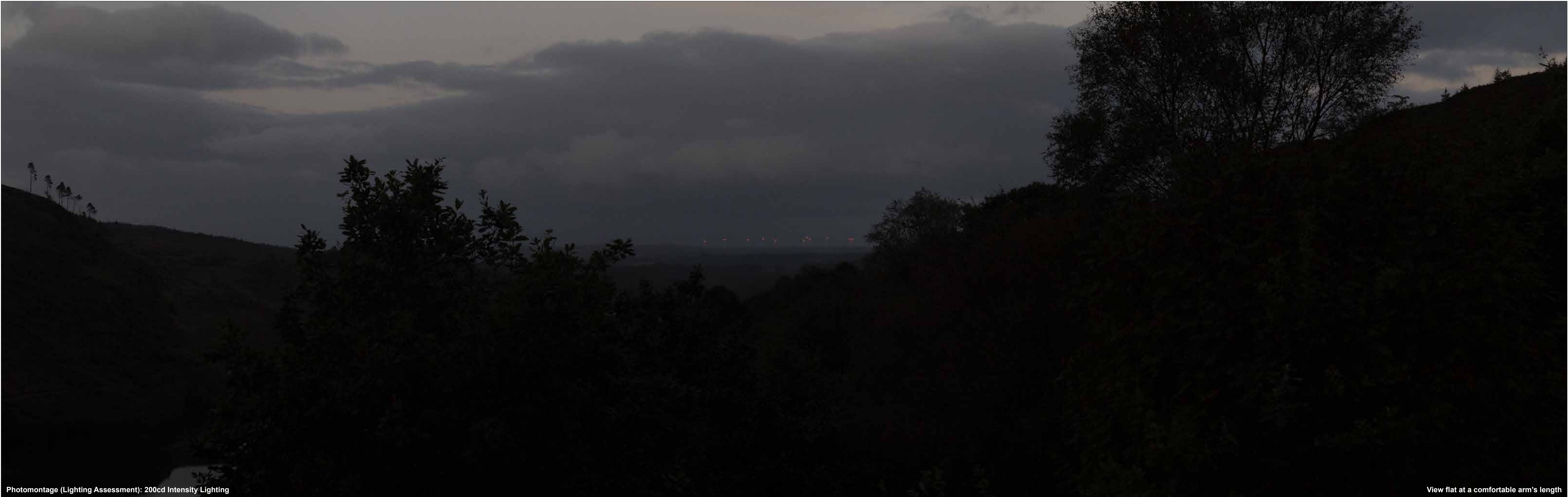
Photomontage (Lighting Assessment): 200cd Intensity Lighting