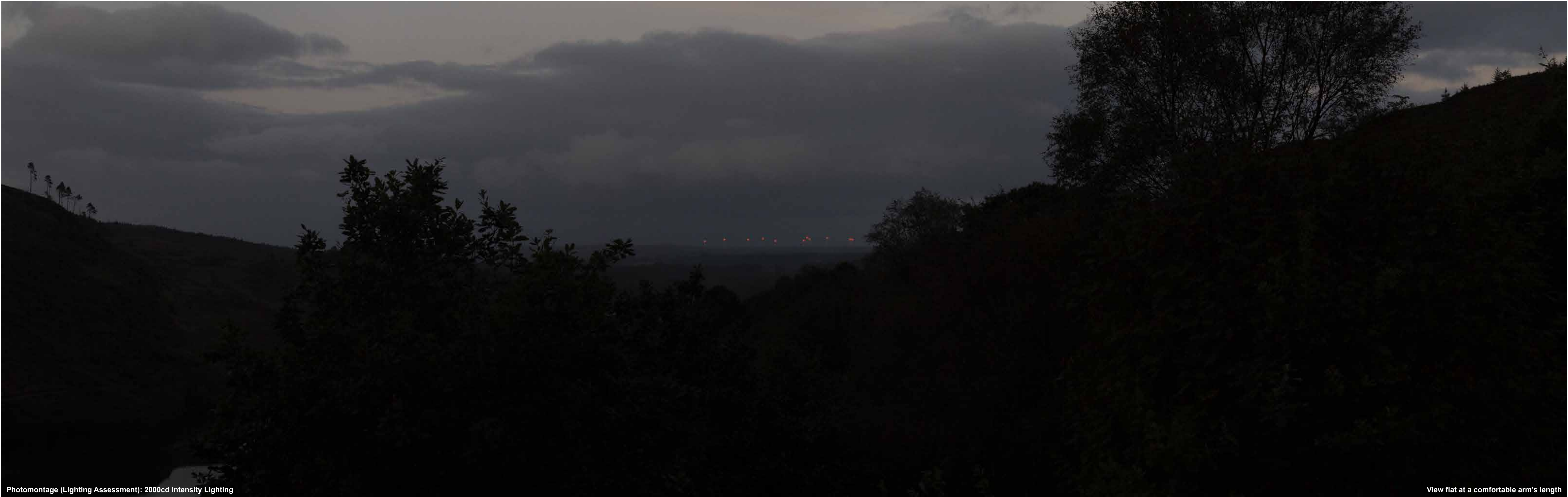
Photomontage (Lighting Assessment): 2000cd Intensity Lighting