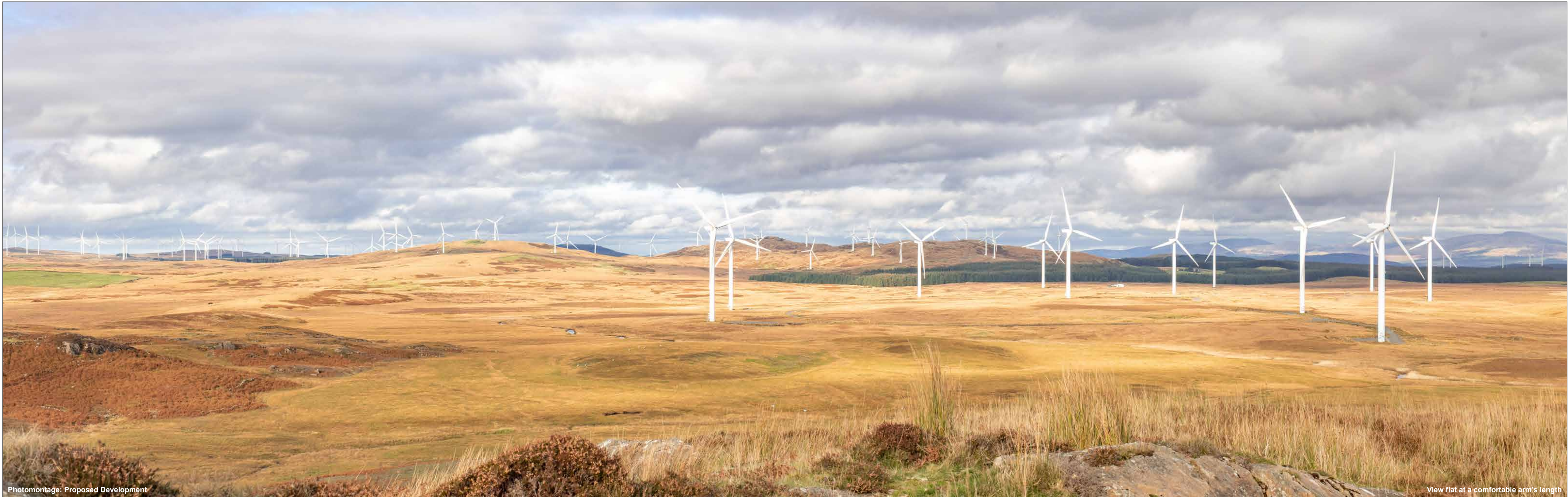
Photomontage: Proposed Development