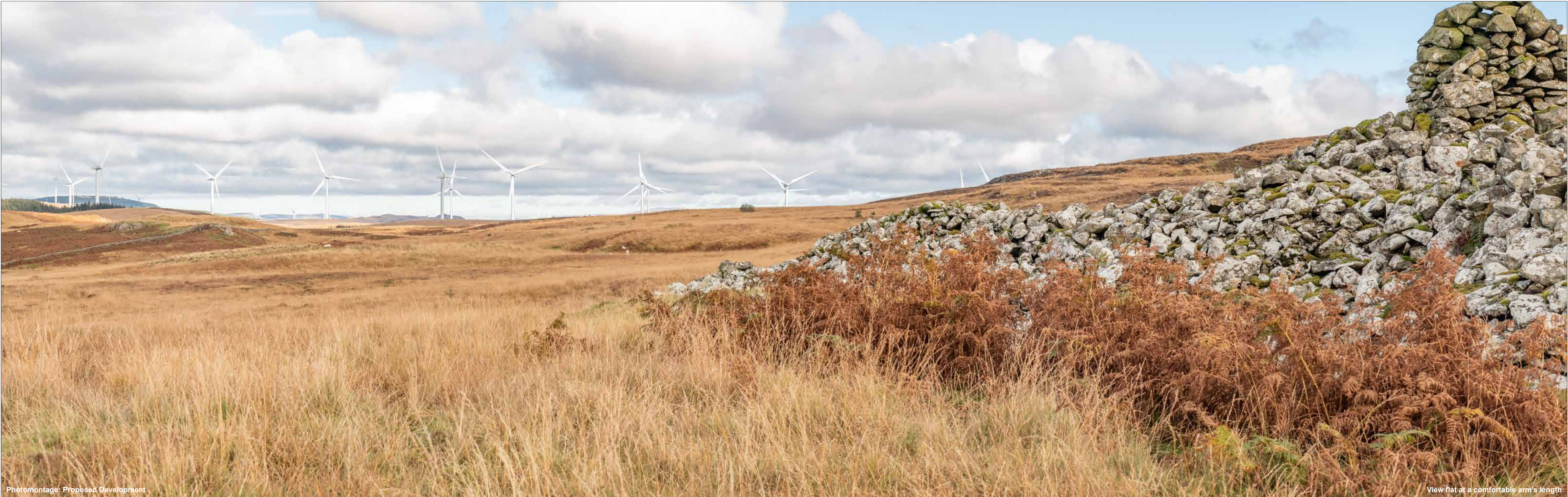
Photomontage: Proposed Development