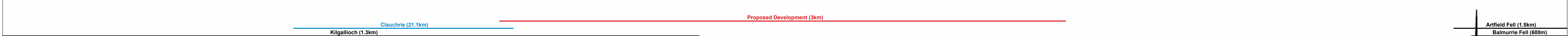
This image provides landscape and visual context only