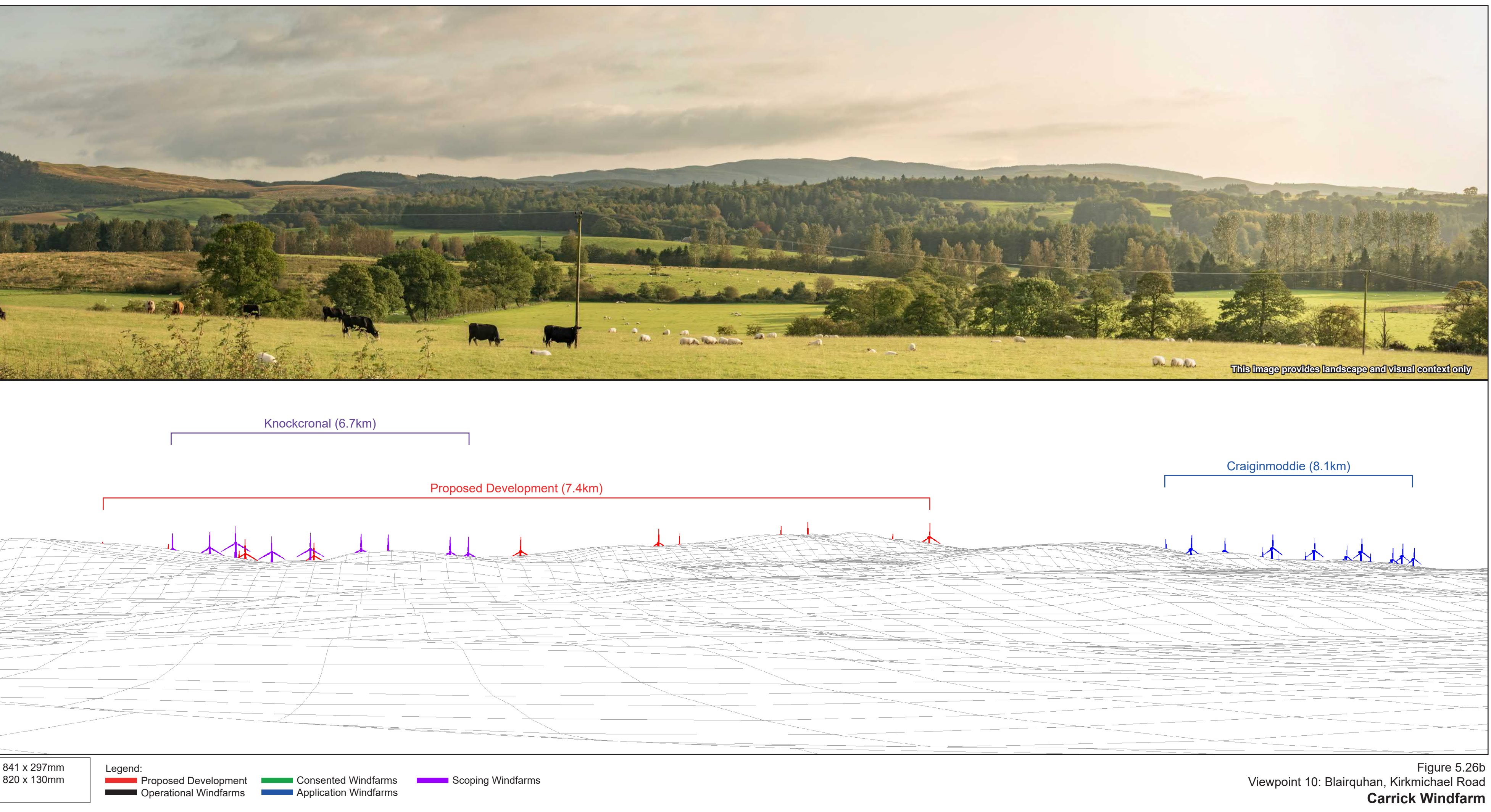
Figure 5.26b Viewpoint 10: Blairquhan, Kirkmichael Road Carrick Windfarm