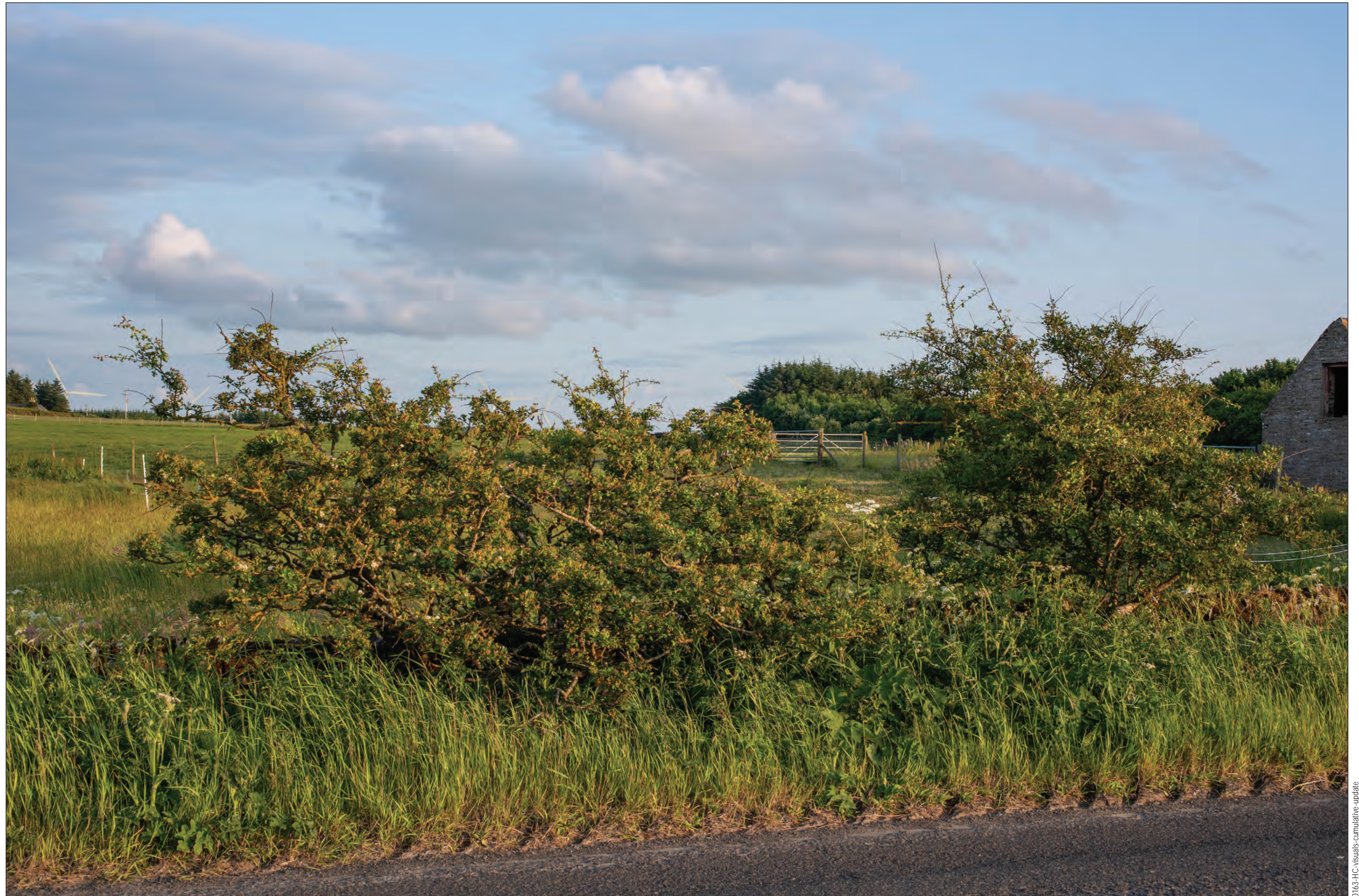
Figure: 7.39-THC-03-CU Viewpoint 26: Mey

When viewed at a comfortable arm's length (approx. 500 mm), this printed image is representative of our detailed central vision, but is not representative of scale and distance.