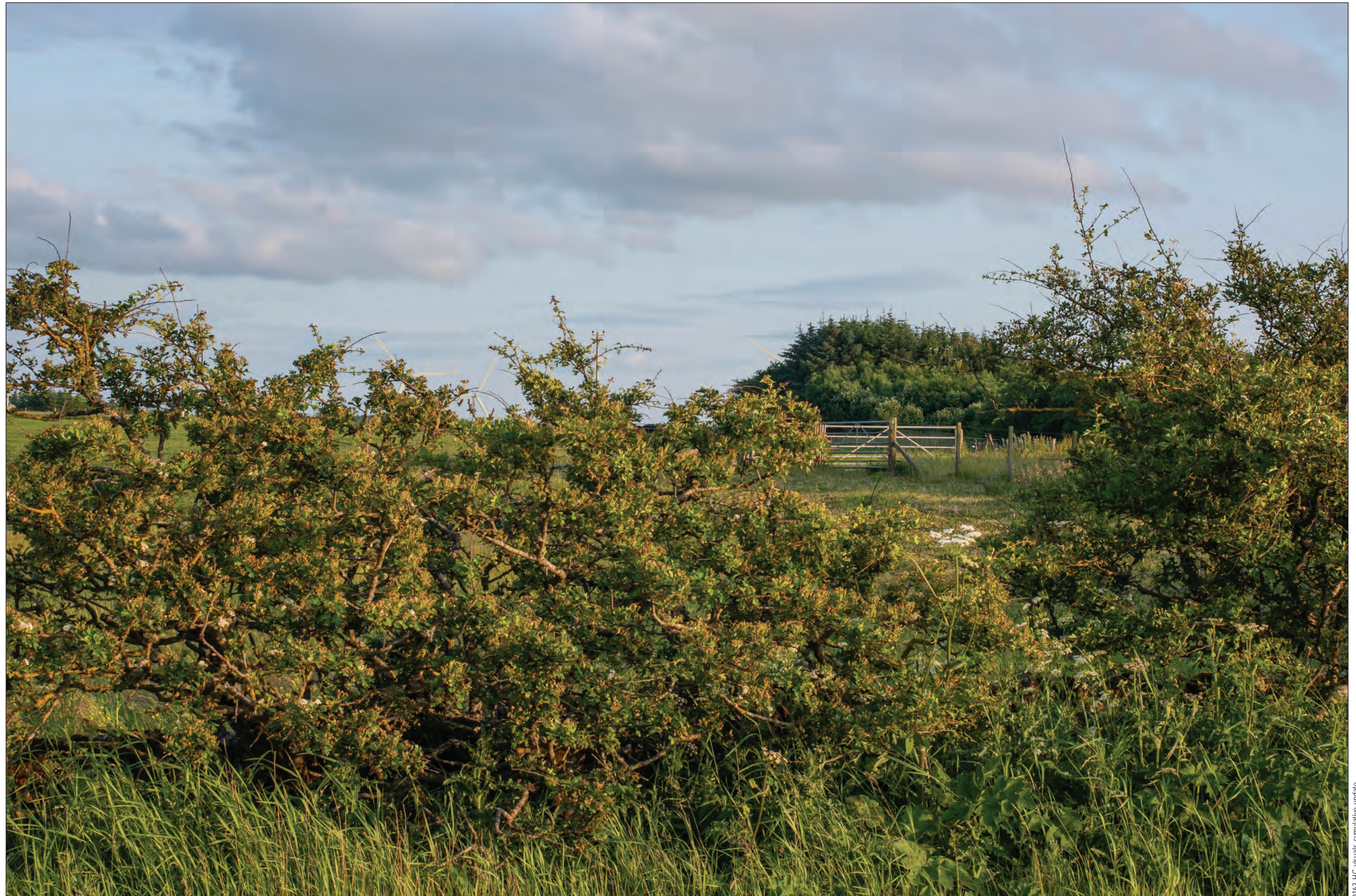
Figure: 7.39-THC-04-CU Viewpoint 26: Mey

This image should be viewed at a comfortable arm's length (Approx. 500 mm)