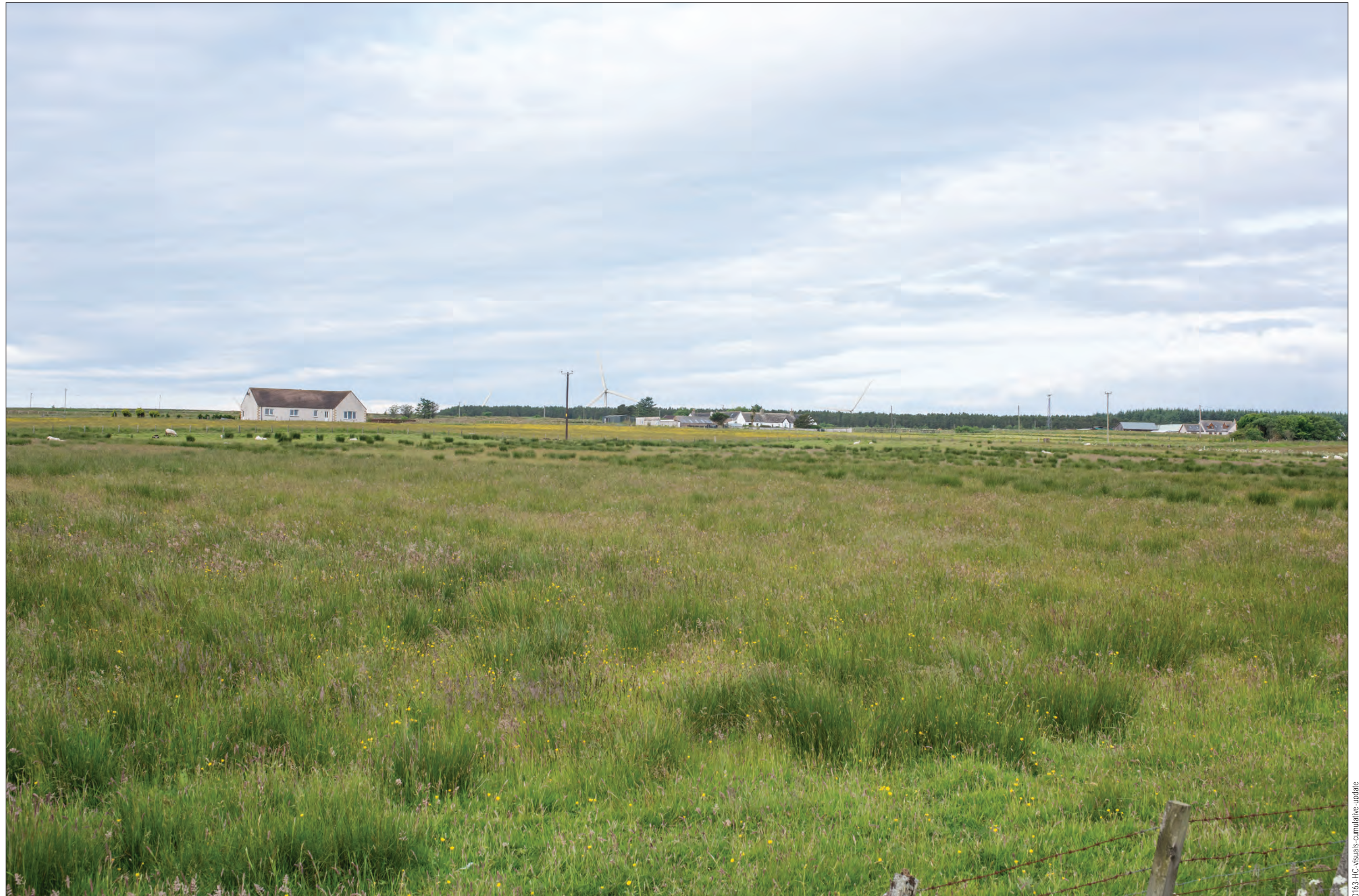
Figure: 7.37-THC-03-CU Viewpoint 24: Upper Gills

When viewed at a comfortable arm's length (approx. 500 mm), this printed image is representative of our detailed central vision, but is not representative of scale and distance.