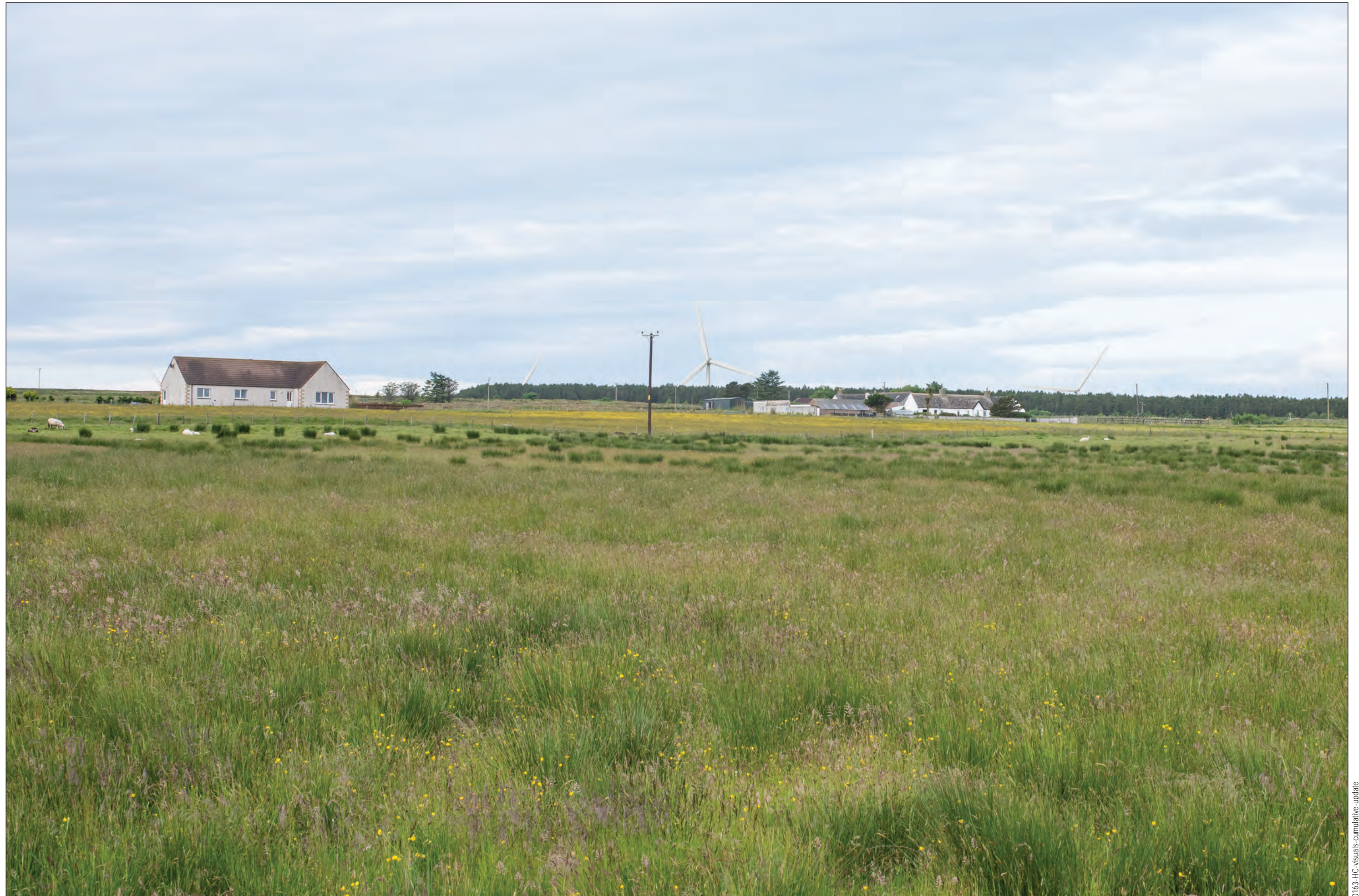
Figure: 7.37-THC-04-CU Viewpoint 24: Upper Gills

This image should be viewed at a comfortable arm's length (Approx. 500 mm)