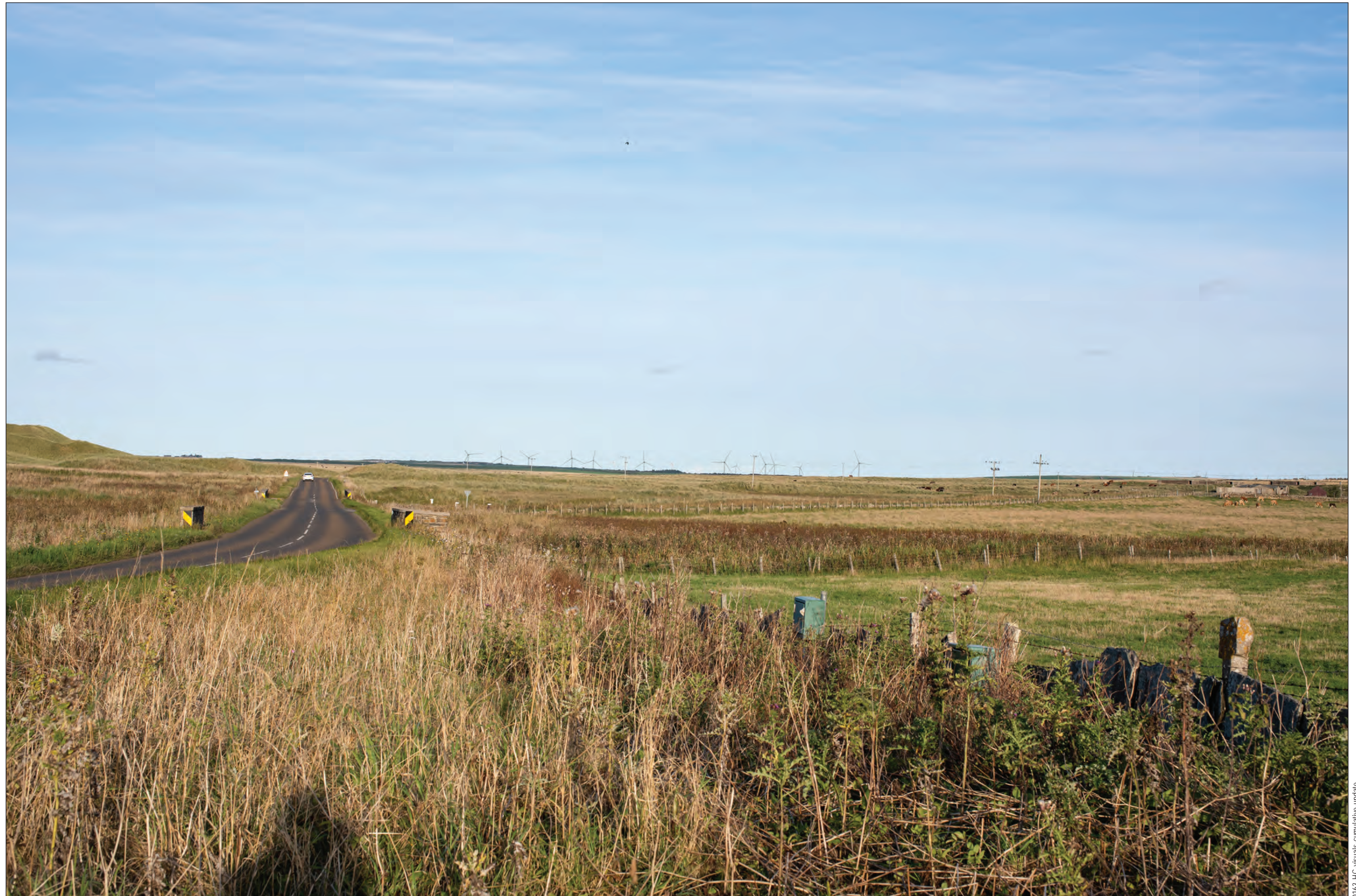
Figure: 7.35-THC-03-CU Viewpoint 22: A836 East of Castletown

When viewed at a comfortable arm's length (approx. 500 mm), this printed image is representative of our detailed central vision, but is not representative of scale and distance.