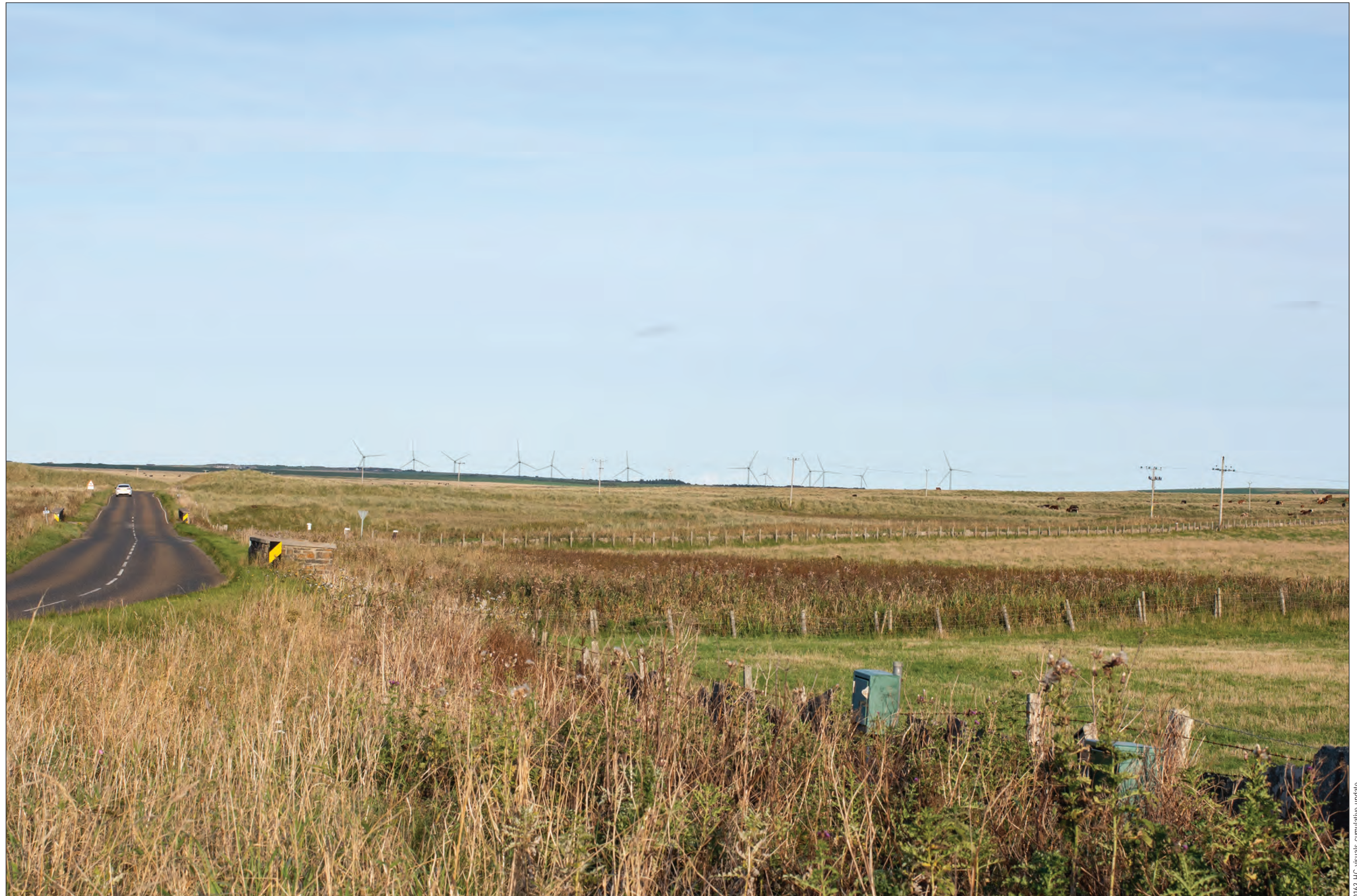
Figure: 7.35-THC-04-CU Viewpoint 22: A836 East of Castletown

This image should be viewed at a comfortable arm's length (Approx. 500 mm)