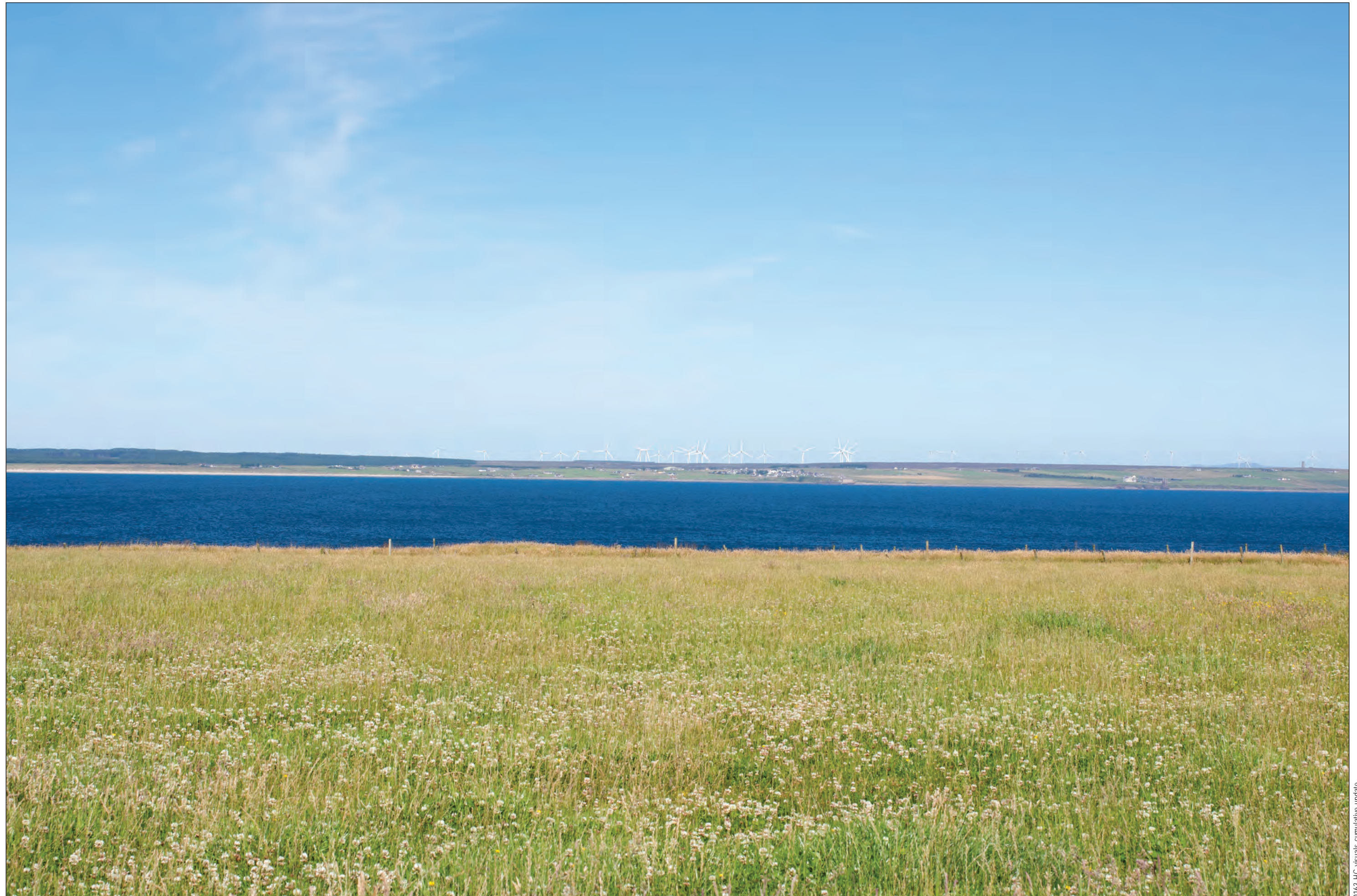
Figure: 7.31-THC-04-CU Viewpoint 18: Noss Head

This image should be viewed at a comfortable arm's length (Approx. 500 mm)