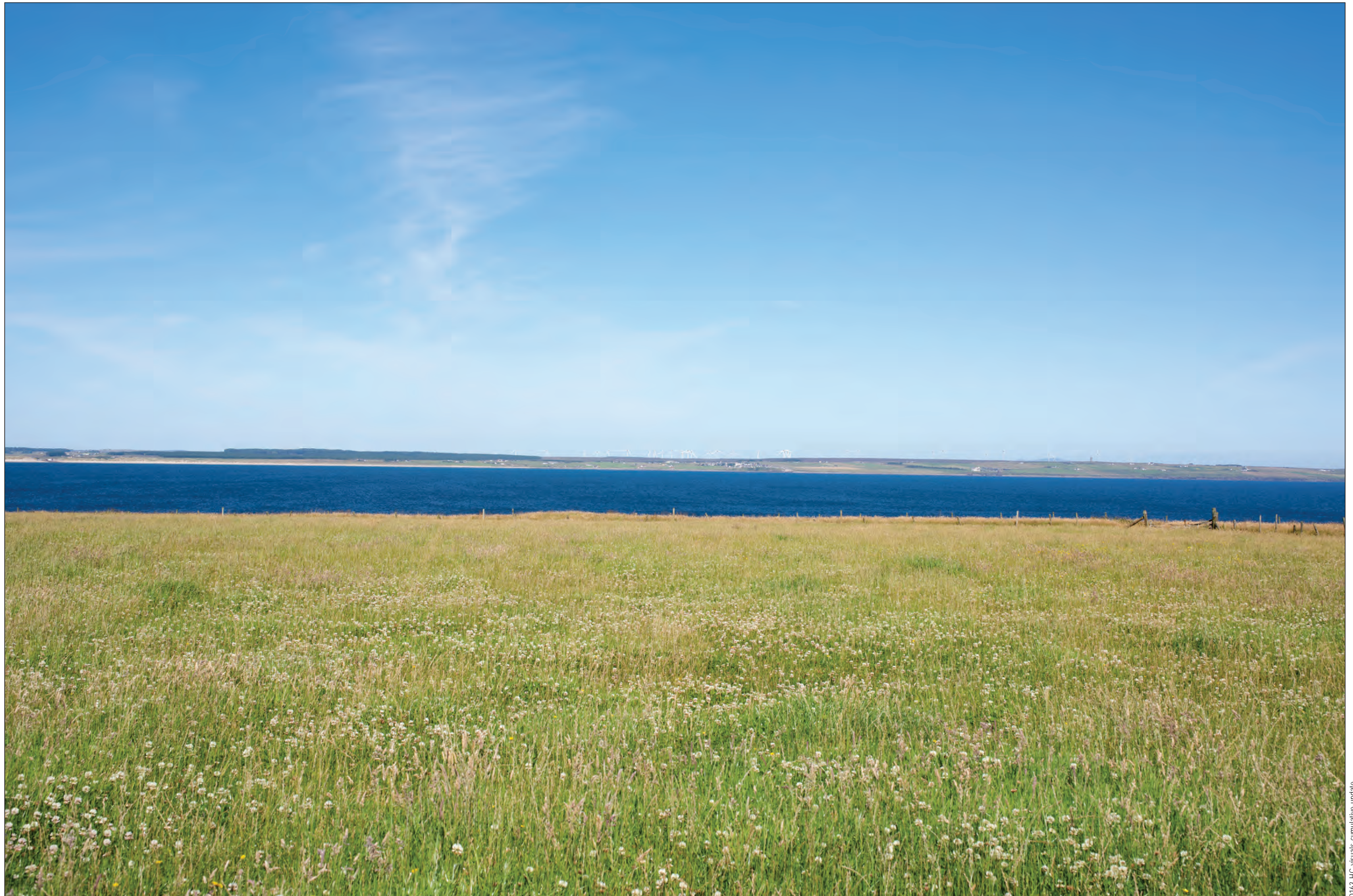
Figure: 7.31-THC-03-CU Viewpoint 18: Noss Head

When viewed at a comfortable arm's length (approx. 500 mm), this printed image is representative of our detailed central vision, but is not representative of scale and distance.