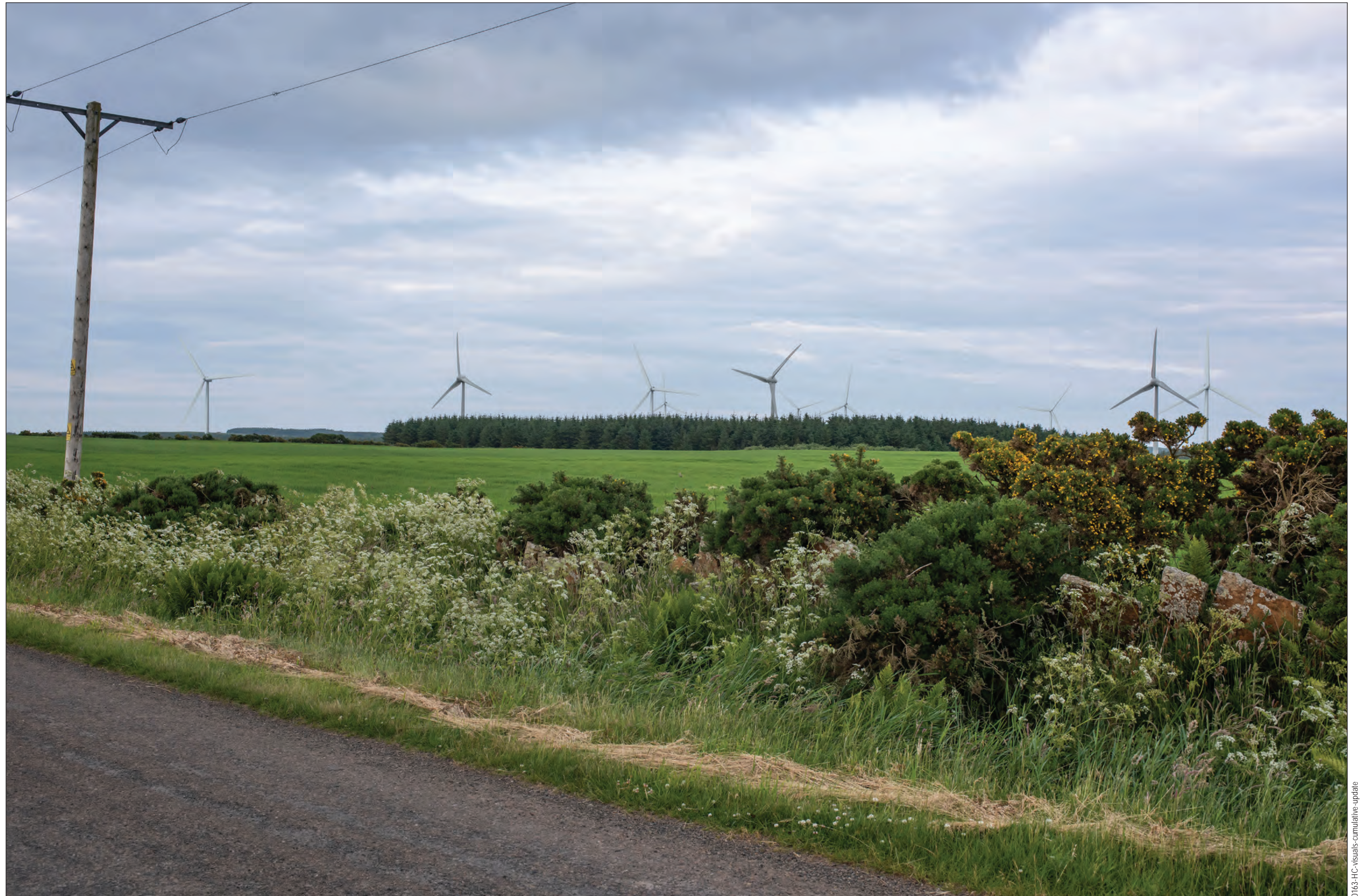
Figure: 7.24-THC-03-CU Viewpoint 11: Lochend (relocated)

When viewed at a comfortable arm's length (approx. 500 mm), this printed image is representative of our detailed central vision, but is not representative of scale and distance.