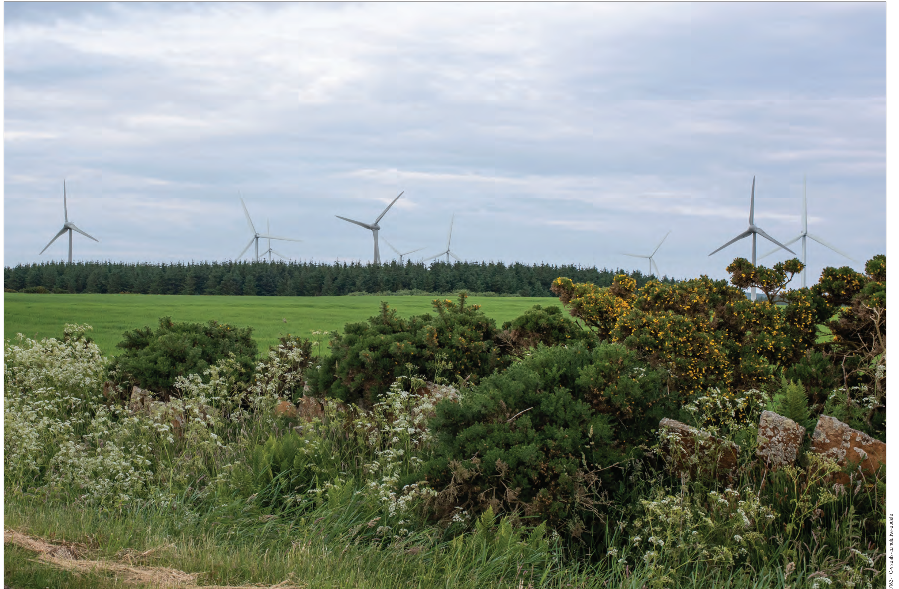
Figure: 7.24-THC-04-CU Viewpoint 11: Lochend (relocated)

This image should be viewed at a comfortable arm's length (Approx. 500 mm)