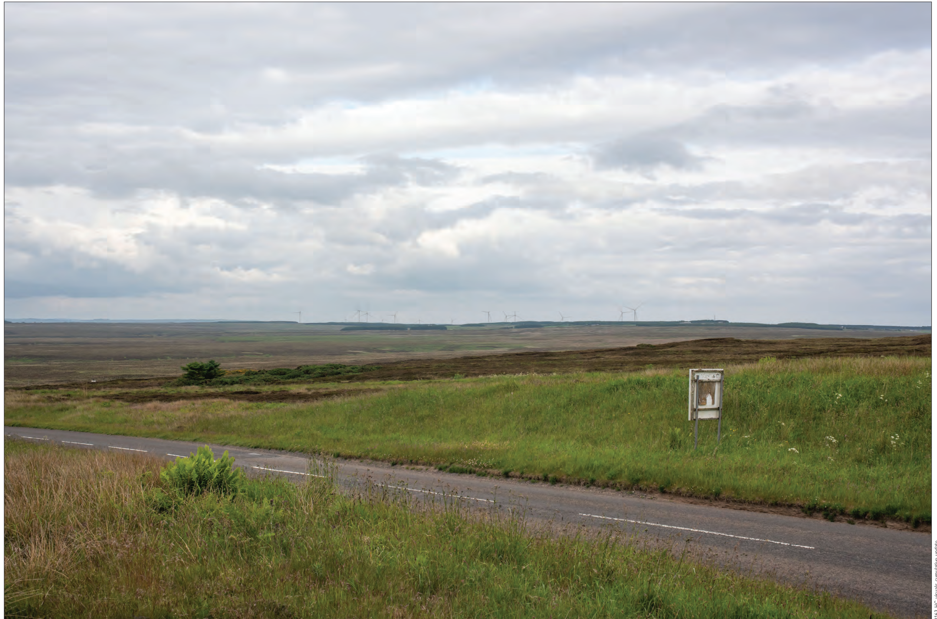
Figure: 7.23-THC-03-CU Viewpoint 10: A99 Warth Hill (relocated)

When viewed at a comfortable arm's length (approx. 500 mm), this printed image is representative of our detailed central vision, but is not representative of scale and distance.