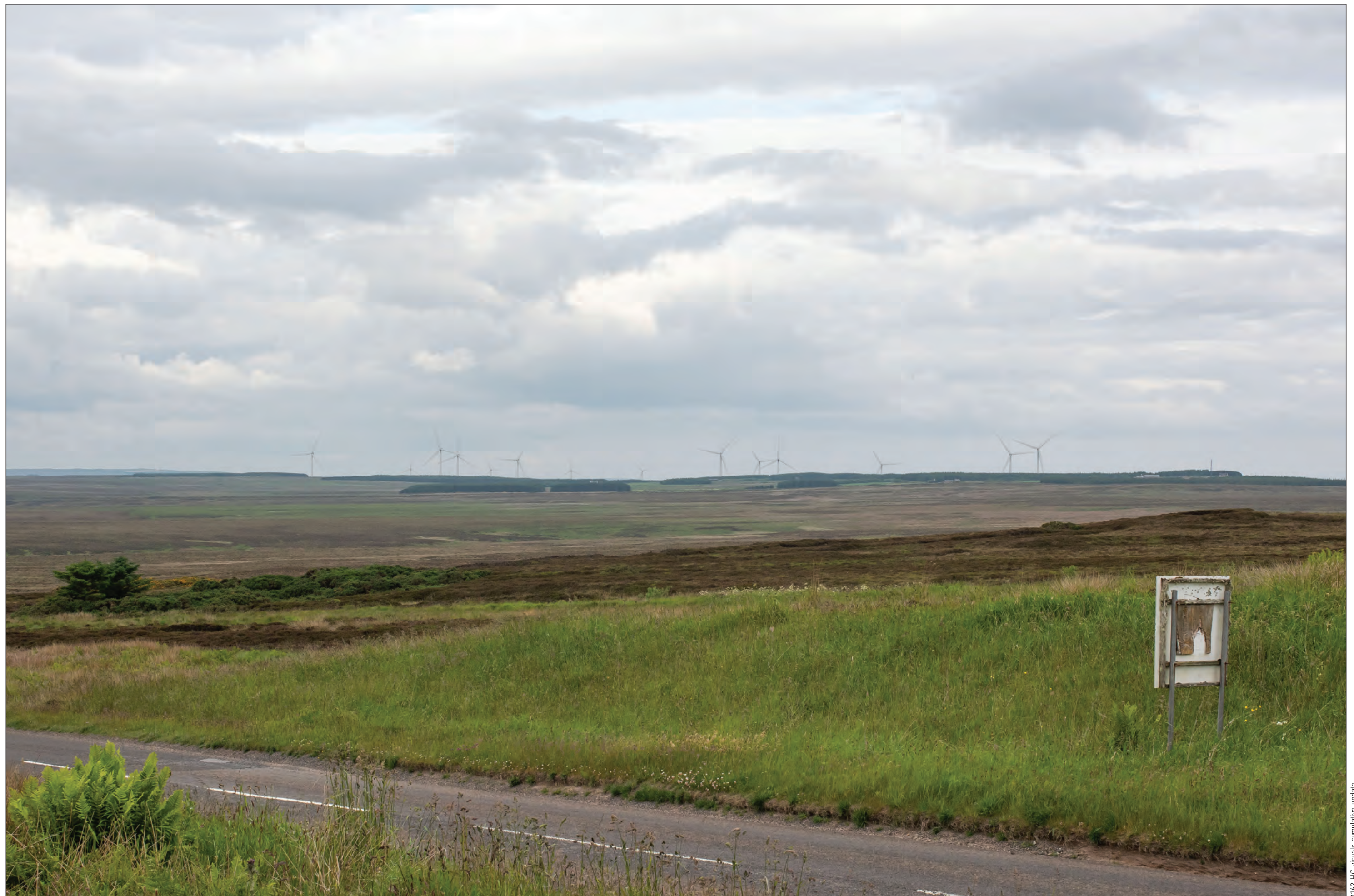
Figure: 7.23-THC-04-CU Viewpoint 10: A99 Warth Hill (relocated)

This image should be viewed at a comfortable arm's length (Approx. 500 mm)