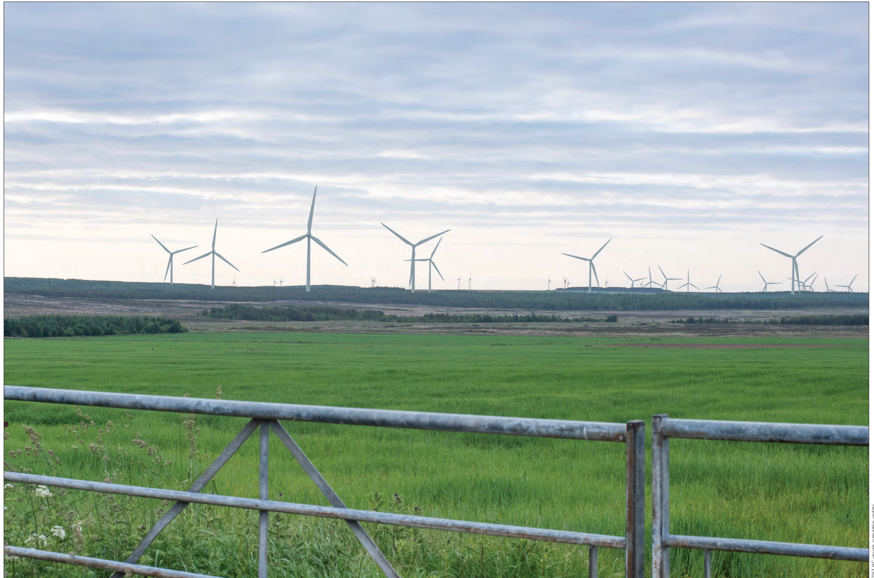
Figure: 7.21-THC-04-CU Viewpoint 8: Barrock (relocated)

This image should be viewed at a comfortable arm's length (Approx. 500 mm)