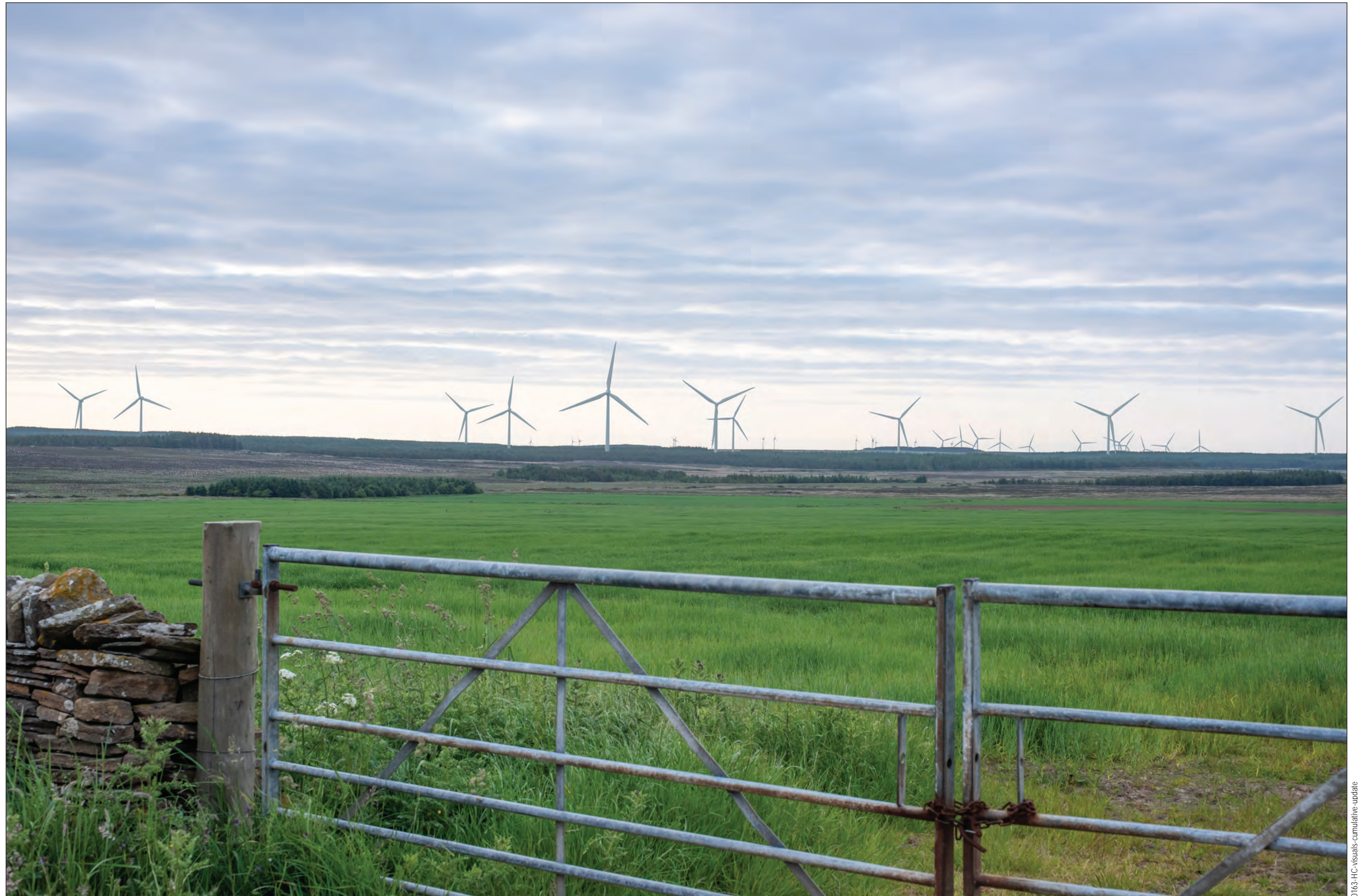
Figure: 7.21-THC-03-CU Viewpoint 8: Barrock (relocated)

When viewed at a comfortable arm's length (approx. 500 mm), this printed image is representative of our detailed central vision, but is not representative of scale and distance.