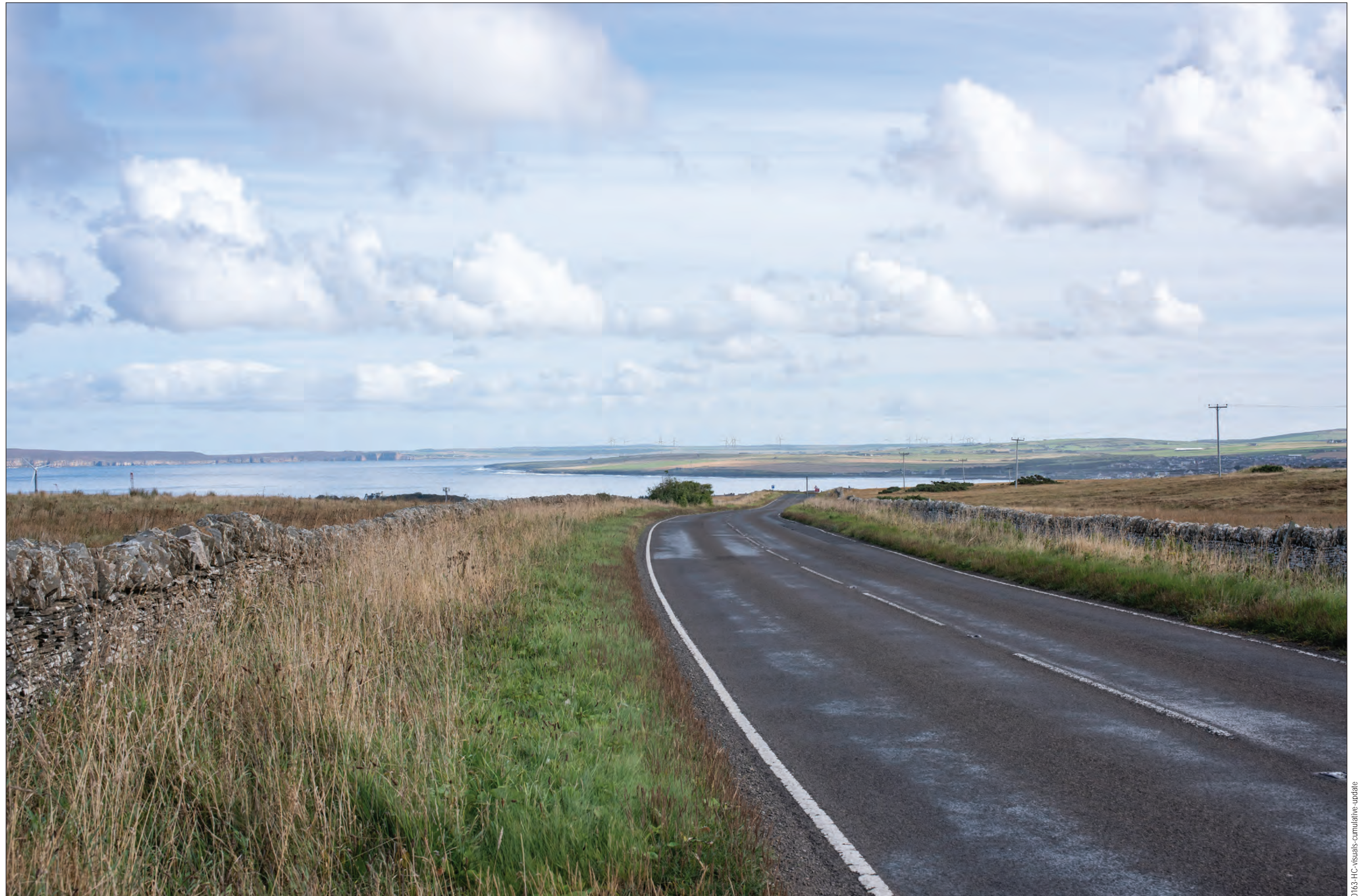
Figure: 7.20-THC-03-CU Viewpoint 7: A836 West of Thurso

When viewed at a comfortable arm's length (approx. 500 mm), this printed image is representative of our detailed central vision, but is not representative of scale and distance.