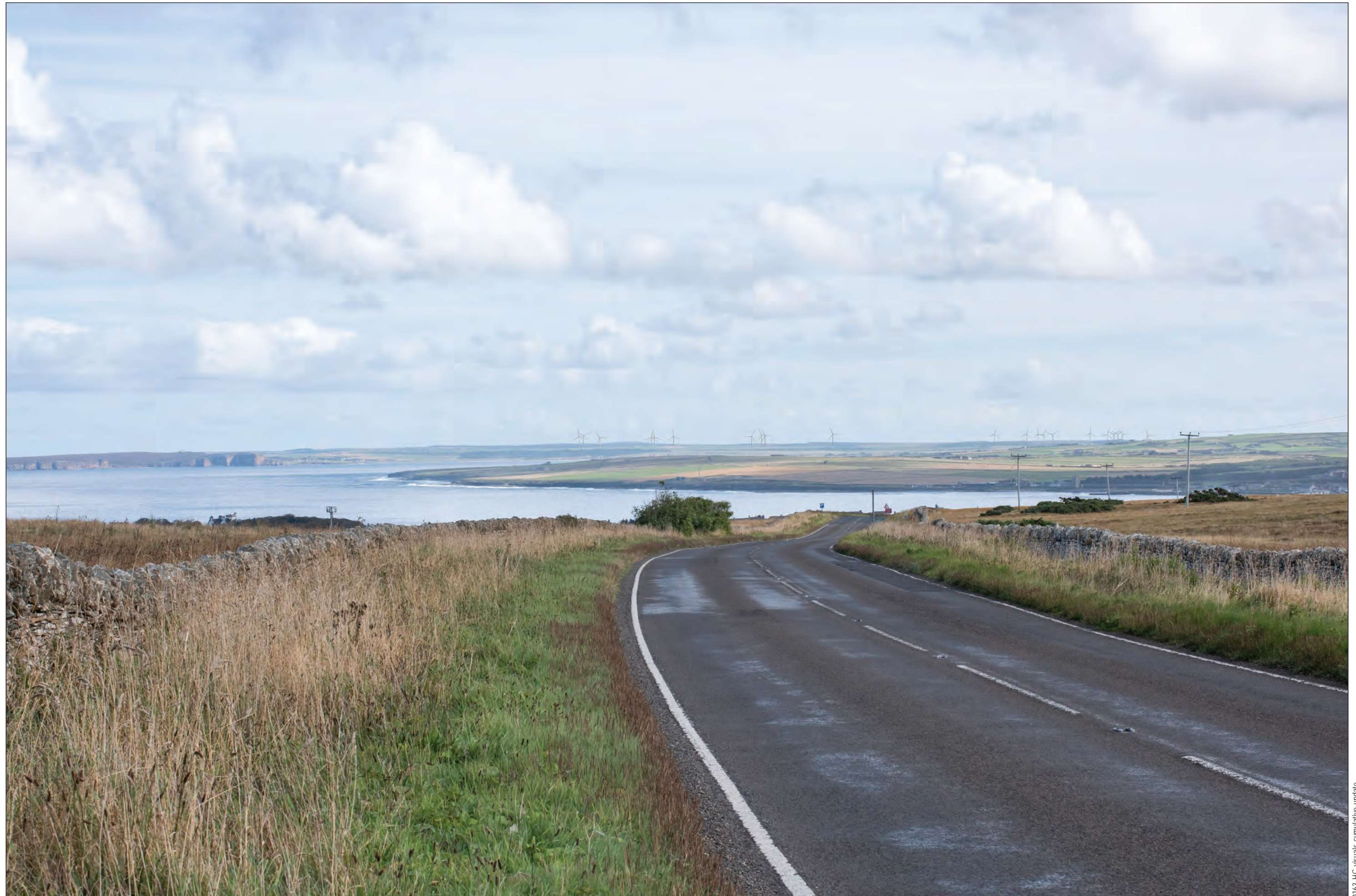
Figure: 7.20-THC-04-CU Viewpoint 7: A836 West of Thurso

This image should be viewed at a comfortable arm's length (Approx. 500 mm)