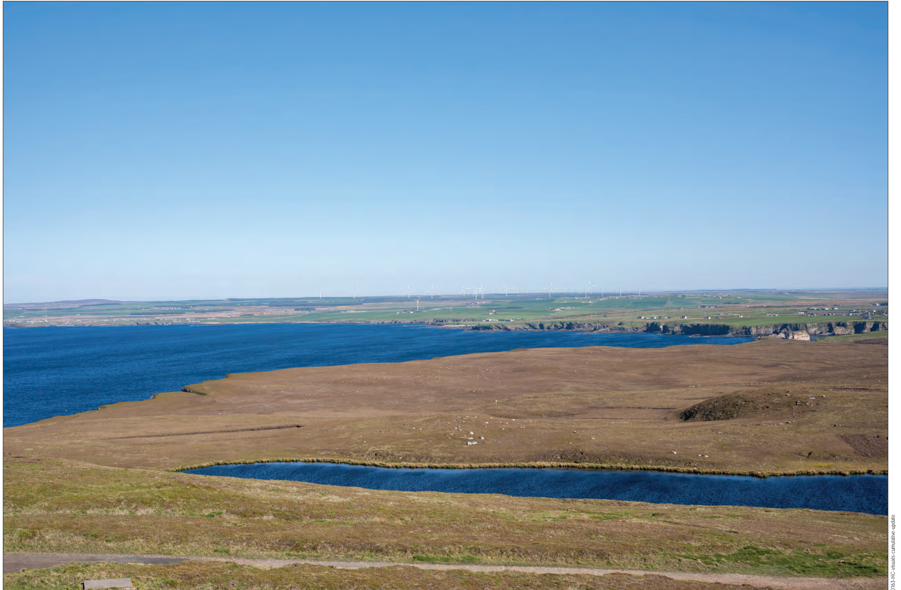
Figure: 7.17-THC-03-CU Viewpoint 4: Dunnet Head

When viewed at a comfortable arm's length (approx. 500 mm), this printed image is representative of our detailed central vision, but is not representative of scale and distance.