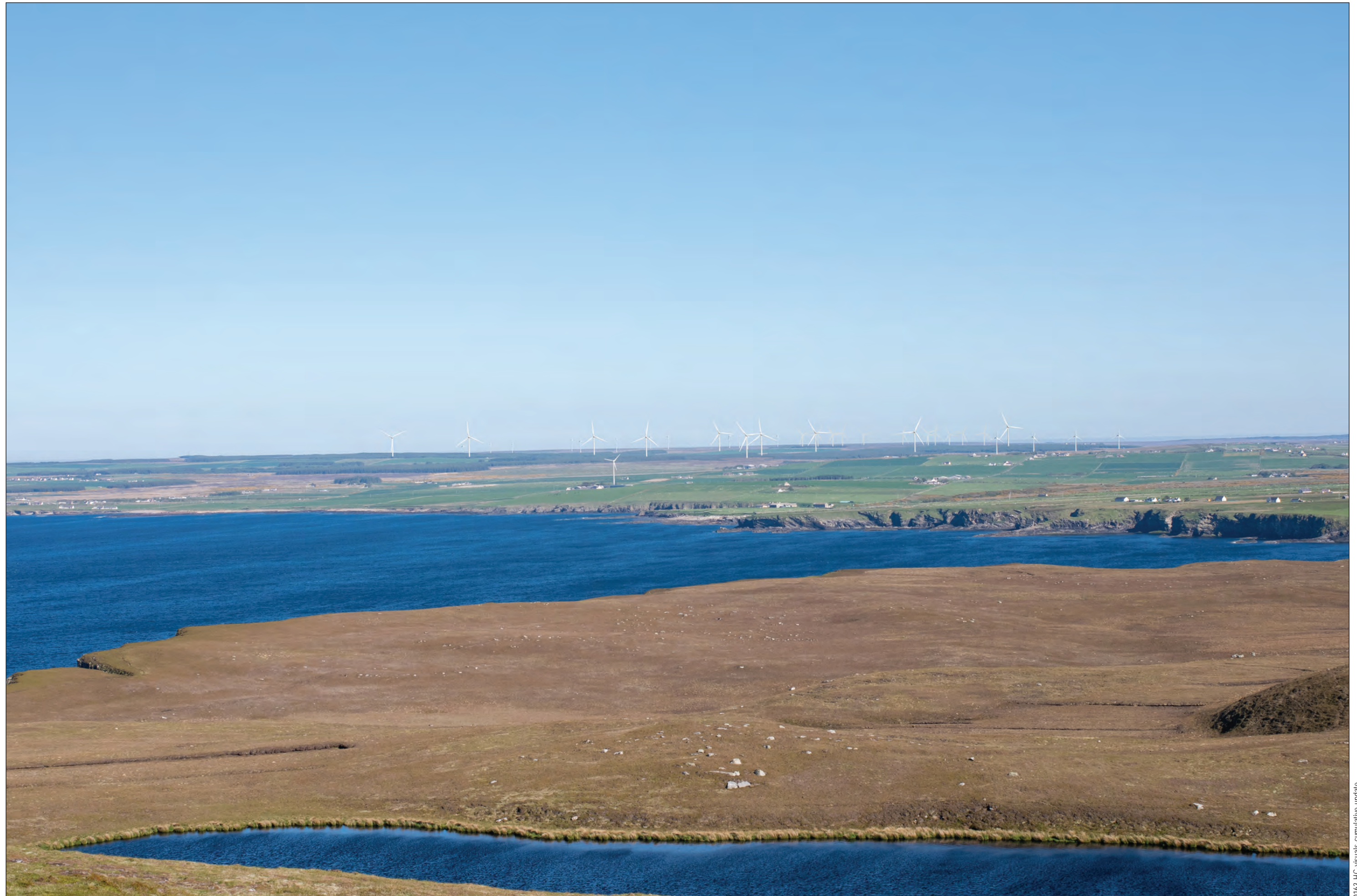
Figure: 7.17-THC-04-CU Viewpoint 4: Dunnet Head

This image should be viewed at a comfortable arm's length (Approx. 500 mm)