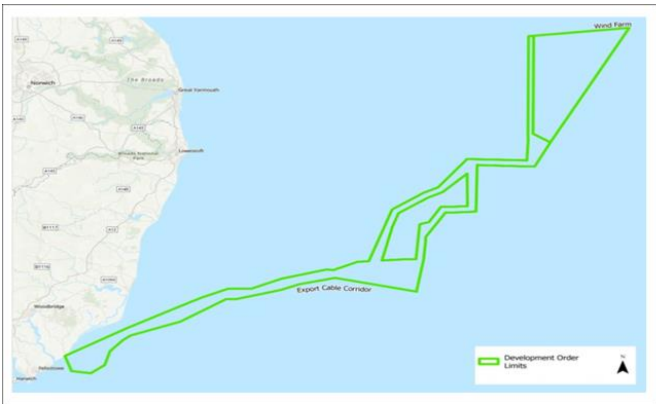
Figure showing Map/ chart of the area: