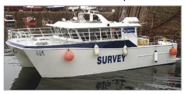
Figure 2.2: MV Lia - Coastal Survey Vessel

The Kommandor Stuart was mobilised in Great Yarmouth on the 30<sup>th</sup> April 2018 and commenced benthic sampling on the 3<sup>rd</sup> May. All grab sampling operations within the operational working area of the vessel (stations deeper than 15 m) were completed by the 5<sup>th</sup> May 2018. The remaining six stations were completed with the MV Lia , which was mobilised from Lowestoft on the 14<sup>th</sup> May. The vessel completed two stations on the 15<sup>th</sup> of May before returning to port due to inclement weather. The last four stations were acquired on the 19<sup>th</sup> of May after which the environmental sampling equipment and personnel were demobilised.