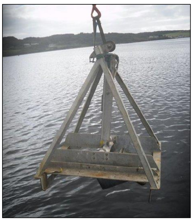
Figure 2.4: Hamon Grab Sediment Sampler

All benthic and contaminant samples were acquired using a 0.1 \text{m}^2 Hamon grab sampler (Figure 2.4). An initial deployment with the Day grab failed to acquire a sample due to the gravel within the sediment, subsequently the Hamon grab was used to acquire all samples.