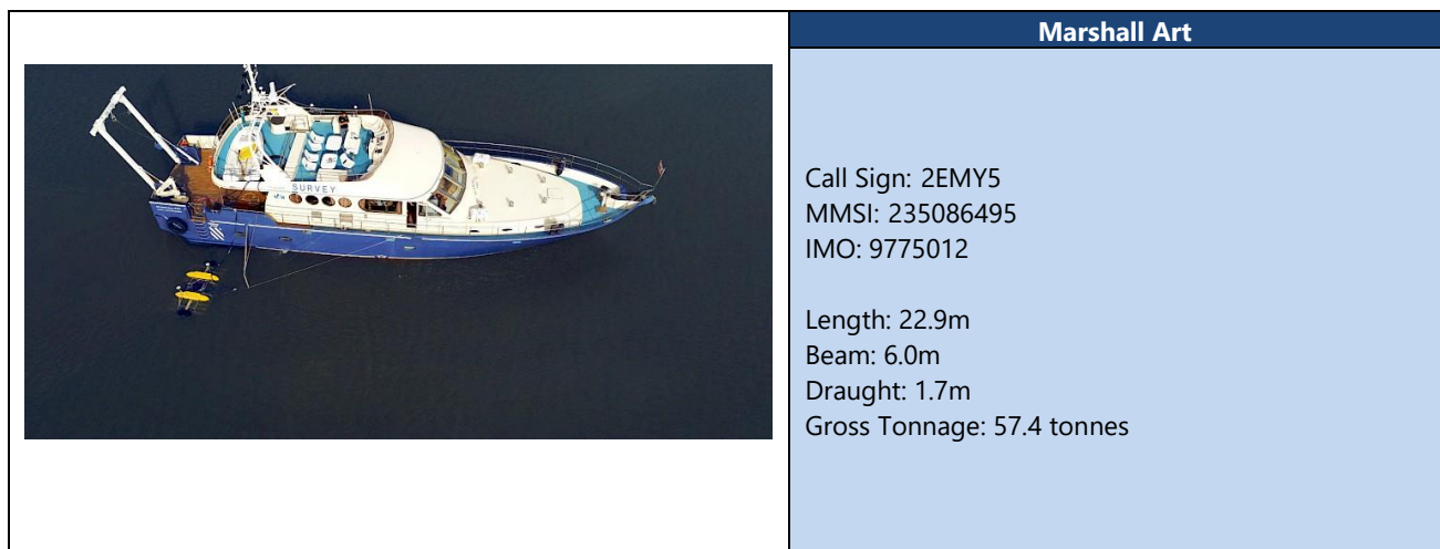
Table 3 Vessel details

Mariners are advised of the following vessels undertaking survey operations at the EA1N and EA2 export cable routes.