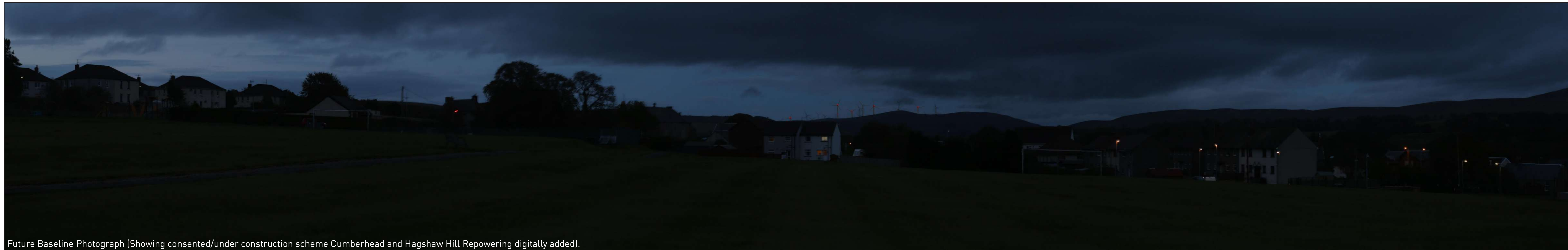
Future Baseline Photograph (Showing consented/under construction scheme Cumberhead and Hagshaw Hill Repowering digitally added).