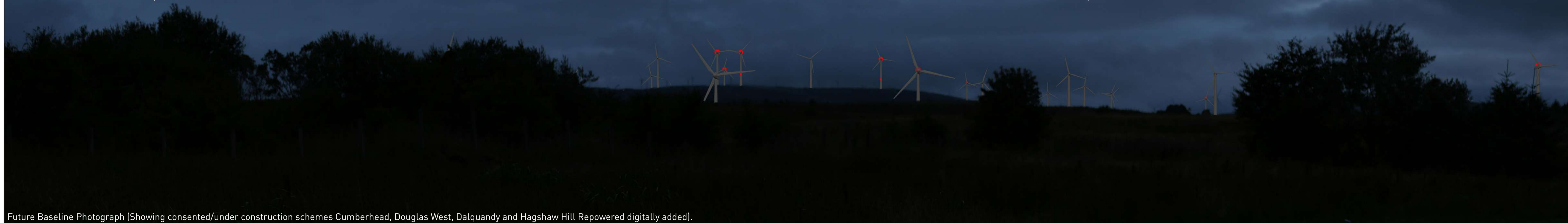
Future Baseline Photograph (Showing consented/under construction schemes Cumberhead, Douglas West, Dalquandy and Hagshaw Hill Repowered digitally added).

53.5 degree extent of images on Sheets C and D.