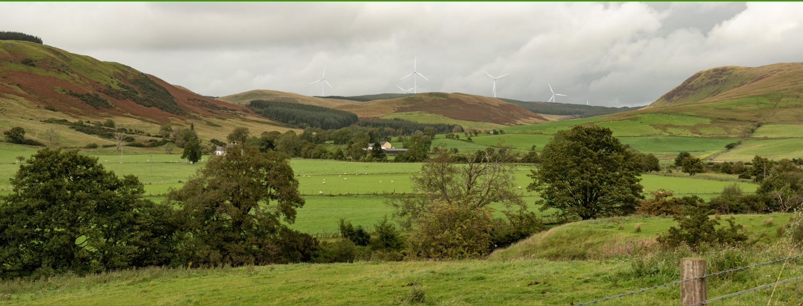
View of the Proposed Development from west of south Balloch, Stinchar valley