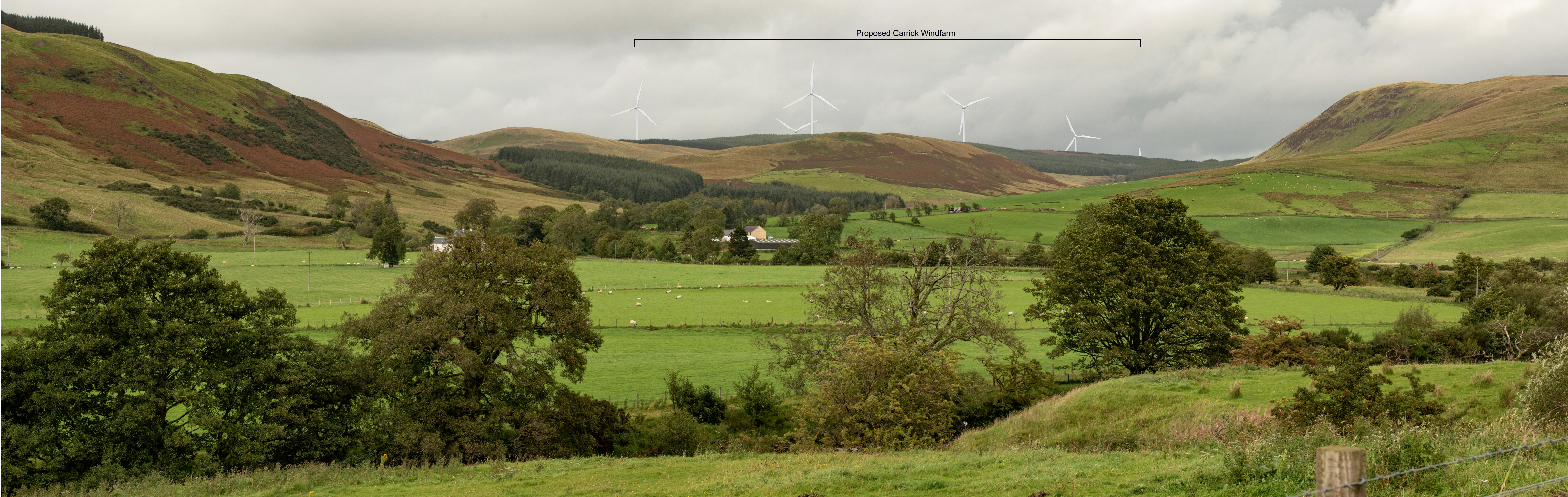
Proposed Carrick Windfarm