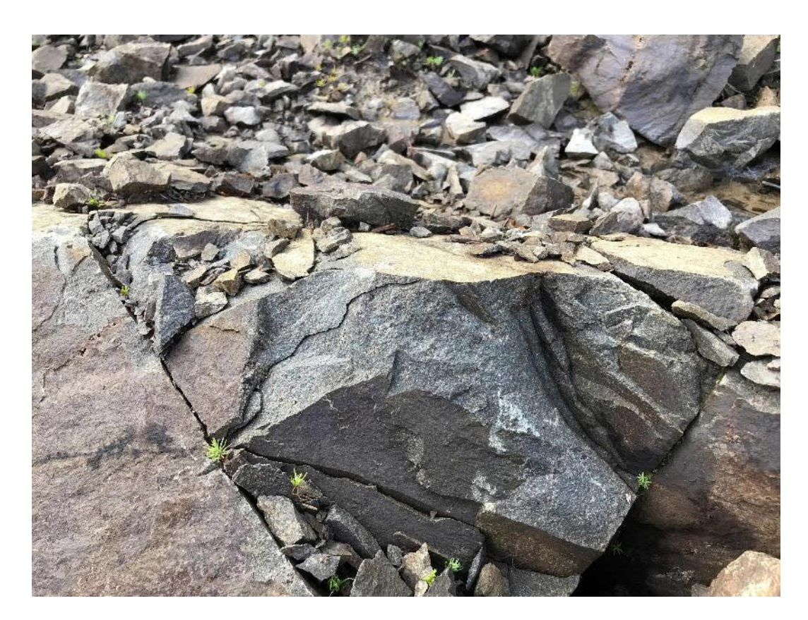
Photograph 3. Rock seen in the existing borrow pit at BP02