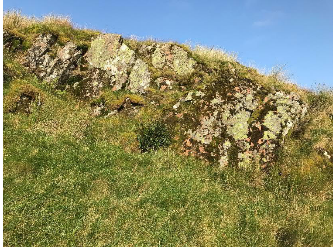
Photograph 1 Rock outcrop approximately 180m north east of BP01 (facing north west, from NGR 237791, 598137).