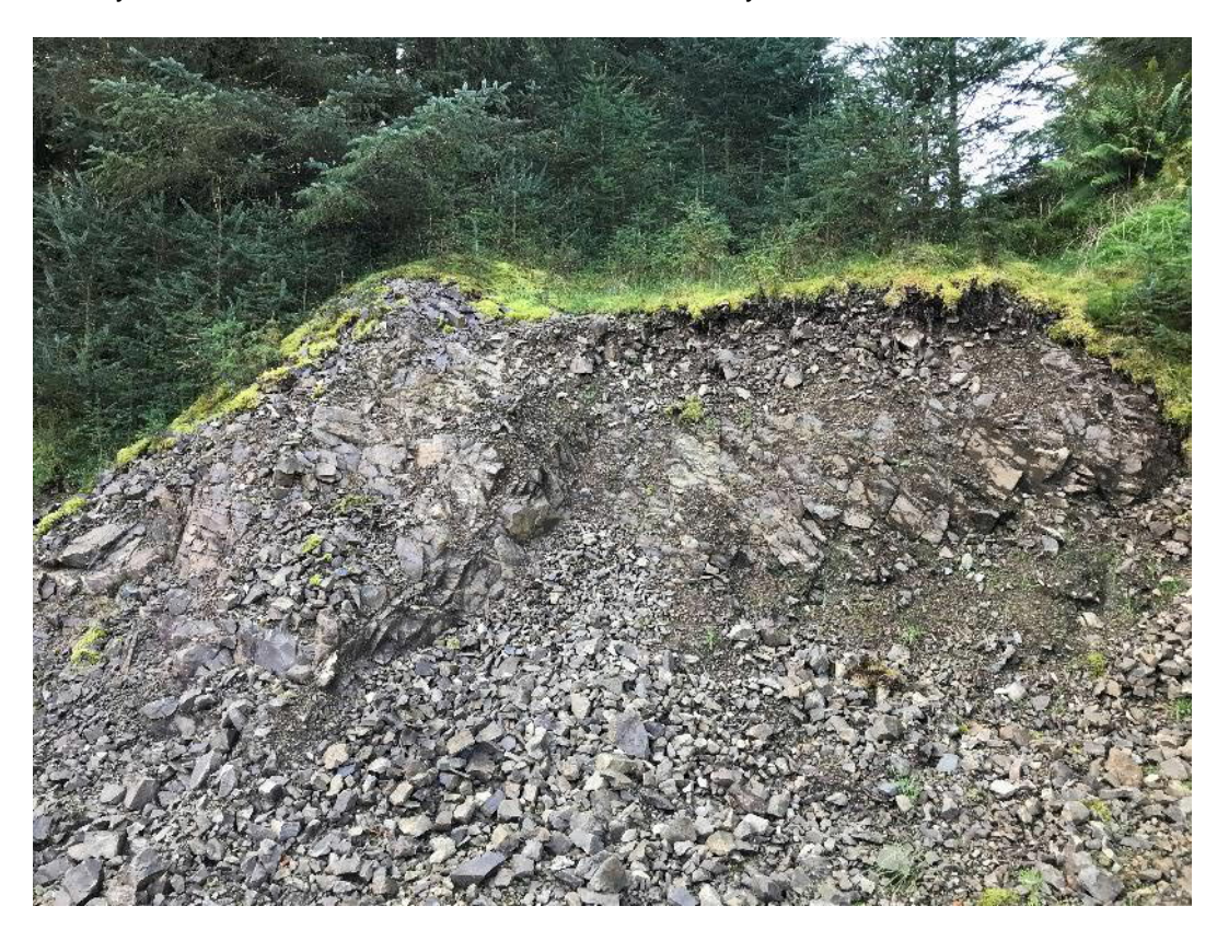
Photograph 2. Cut face at the area of BP02 (facing southwest, from NGR 237124, 598479)