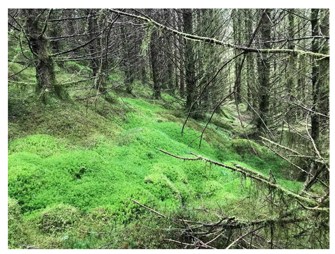
Photograph 7. Typical setting of BP04 (Facing northwest, from NGR 399386, 6124137)