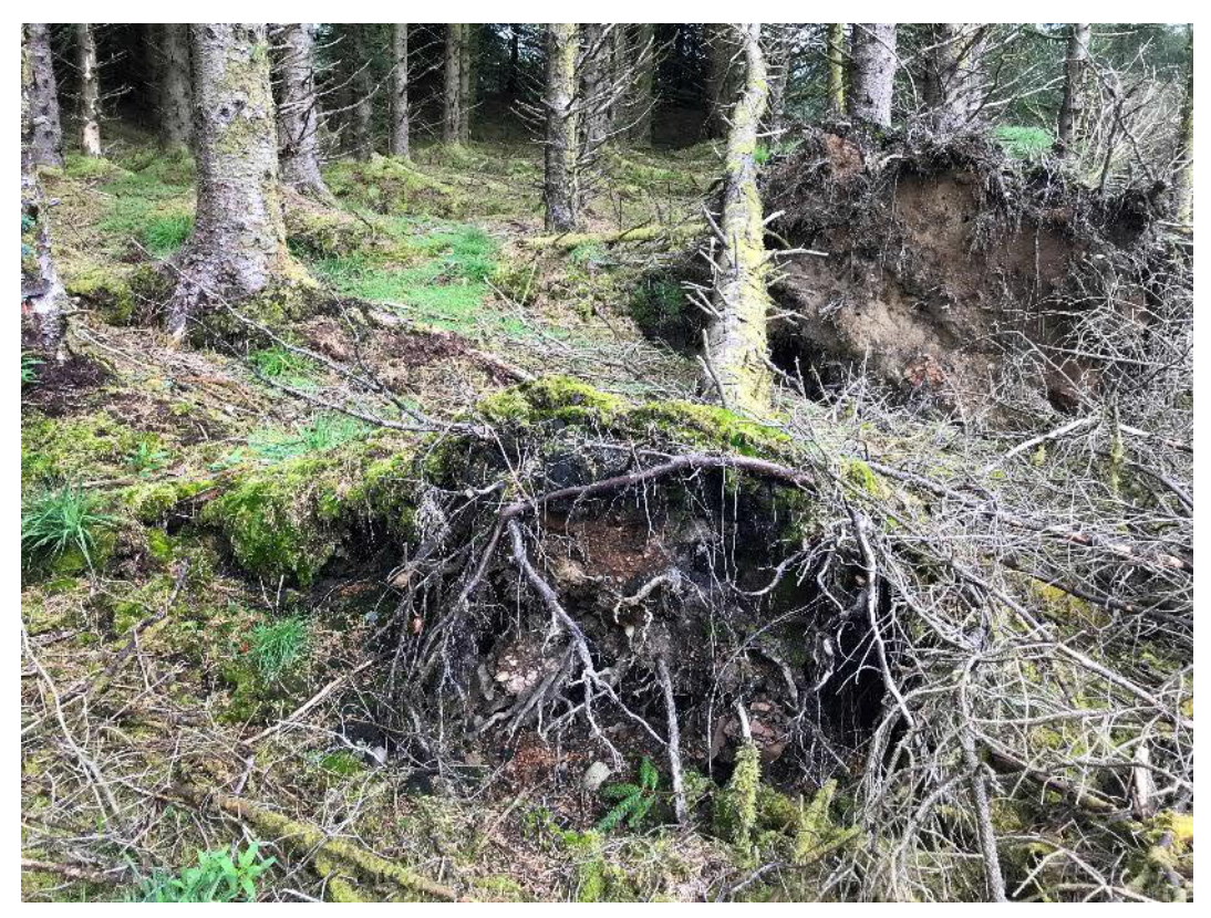
Photograph 4. Shallow bedrock can be seen in an area exposed by a fallen tree in the area of BP03 (taken at NGR 399362, 6124109)