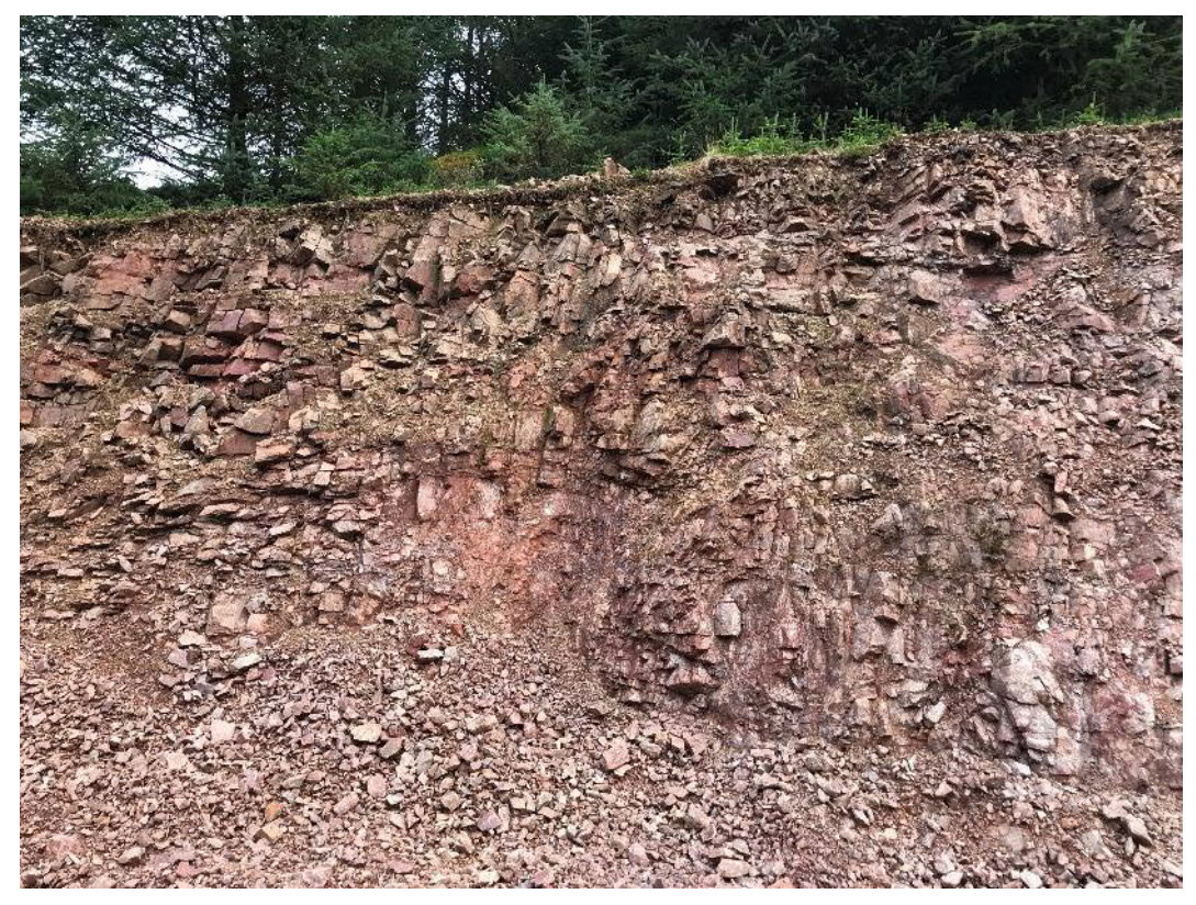
Photograph 5. Cut wall in existing borrow pit at BP03 (facing south, from NGR 399386, 6124137)