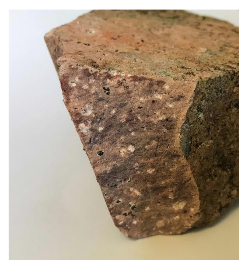
Photograph 6. Rock sample recovered from area of BP03