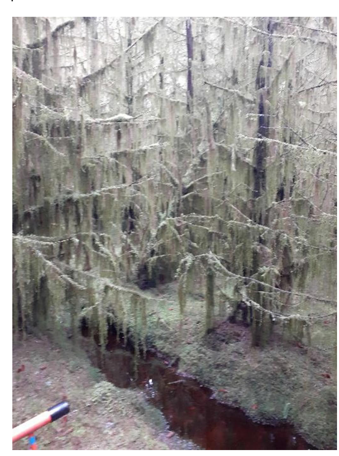
Photograph 6.2.3. Looking West From 236449, 598947, From the Proposed Wind Turbine 7