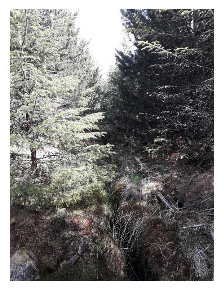
Photograph 6.2.4. Looking West from 238634, 598715, Approximately 40m North of the Proposed Wind Turbine 10