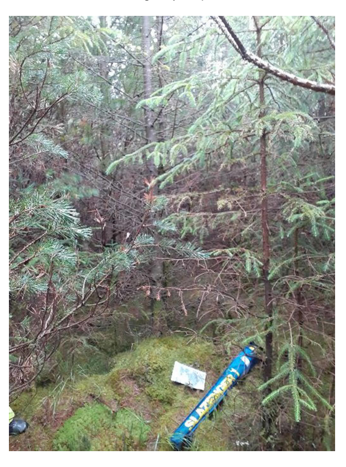
Photograph 6.2.5. Looking North from 238010, 597329, Approximately 20m West of Wind Turbine 13

116. Should amorphous catotelmic peat be confirmed or additional areas identified during pre-construction or construction activities, this material should be reported and consideration should be given to relocating infrastructure within the micrositing allowance, or use of alternative methods of construction to reduce excavation. The Geotechnical Risk Register should include for potential excavation and management of this material.