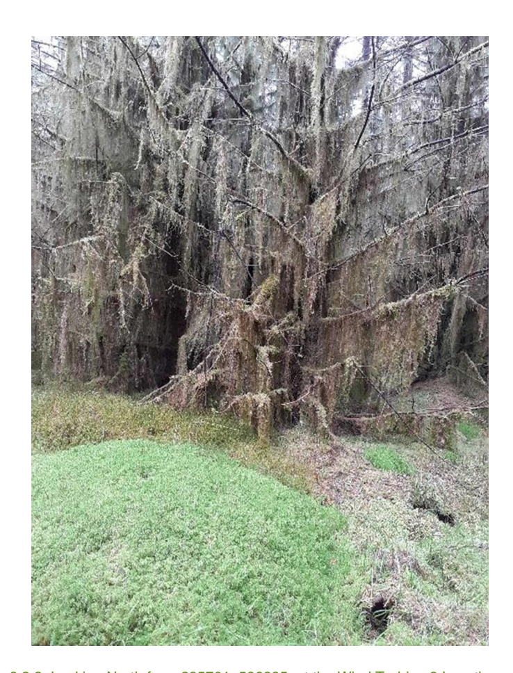
Photograph 6.2.2. Looking North from 235701, 599335, at the Wind Turbine 3 Location