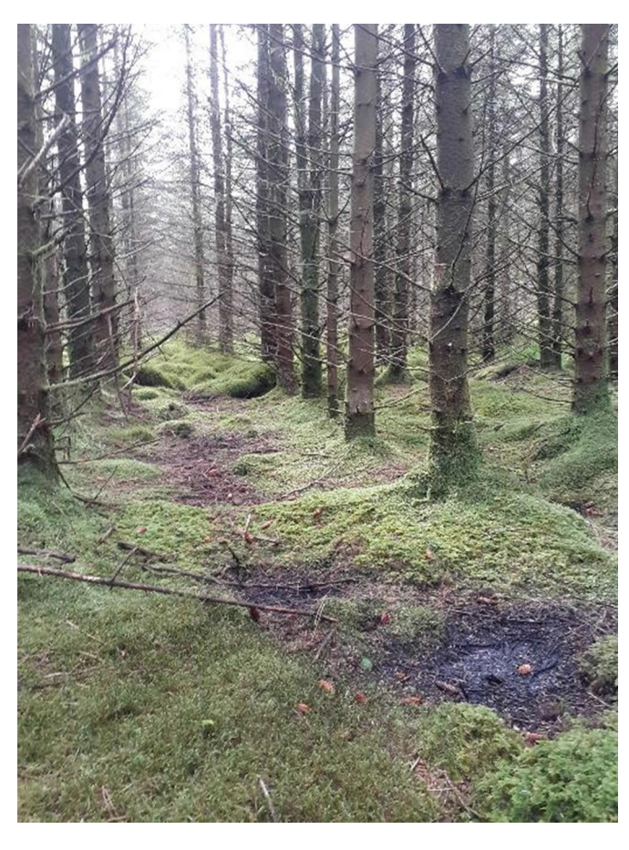
Photograph 6.2.1. Looking South from 234298, 599022, Approximately 10m South of Wind Turbine 1