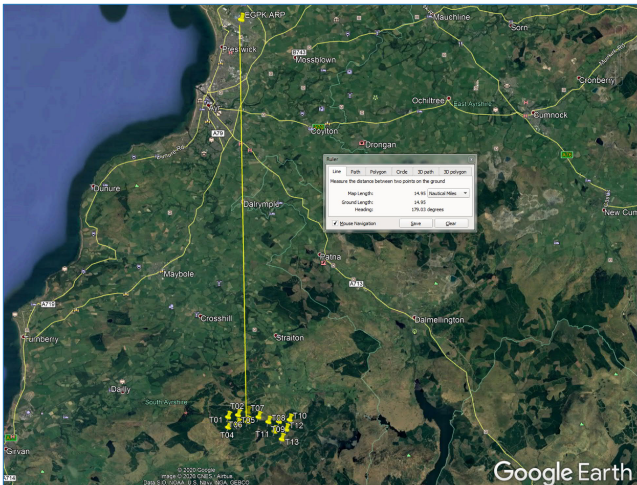
Figure 1: Approximate distance from ARP

These IFPs are particularly important during adverse weather conditions when flight visibility is reduced as they provide the pilot with assurances that there are no obstacles on the defined flight path. Whilst on the descent, the aircraft reaches a Decision Point at which the pilot must have the required visual references 1 , if these references are not visually acquired the pilot must initiate a missed approach; this portion of flight is also protected and is assessed.