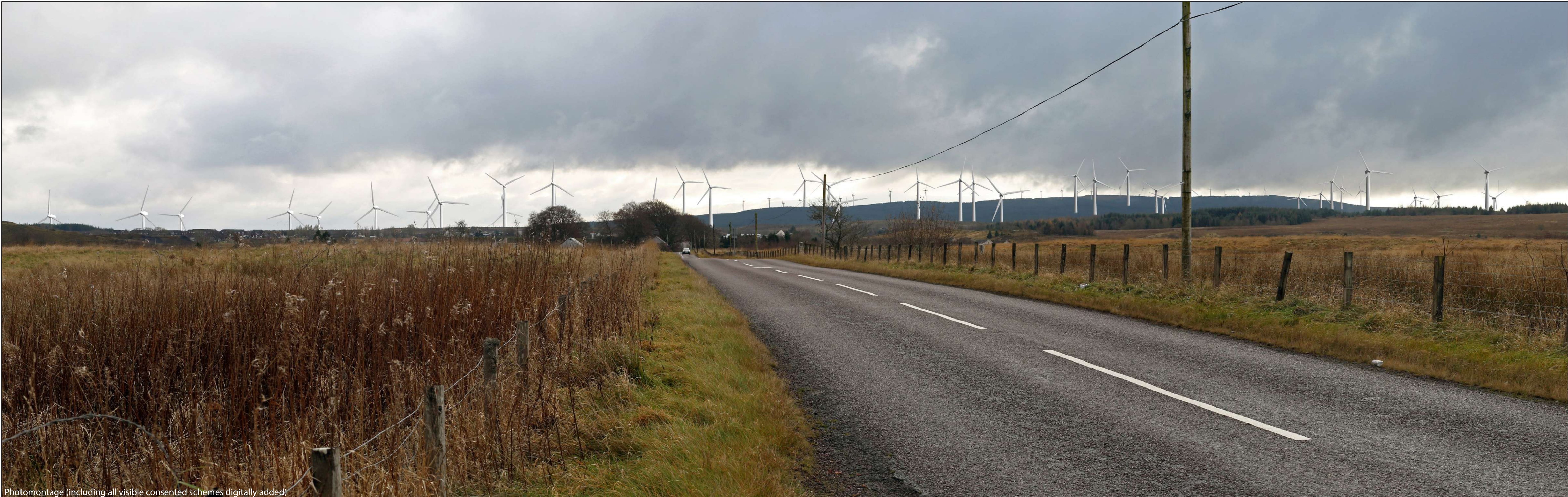
Photomontage (including all visible consented schemes digitally added)