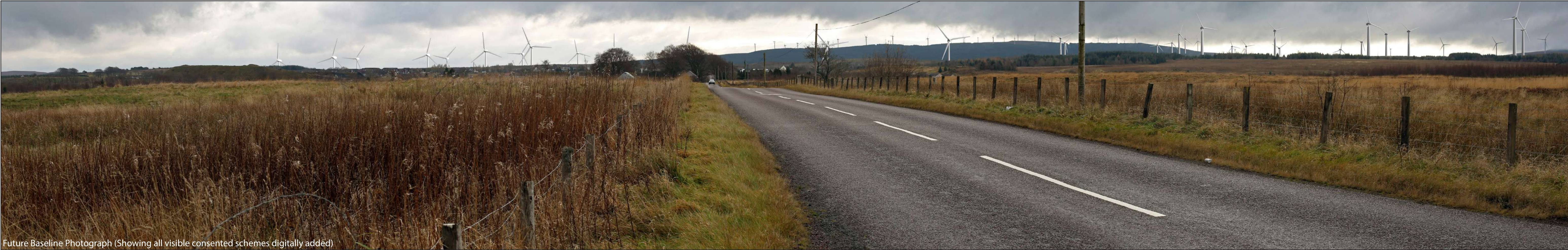
Future Baseline Photograph (Showing all visible consented schemes digitally added)