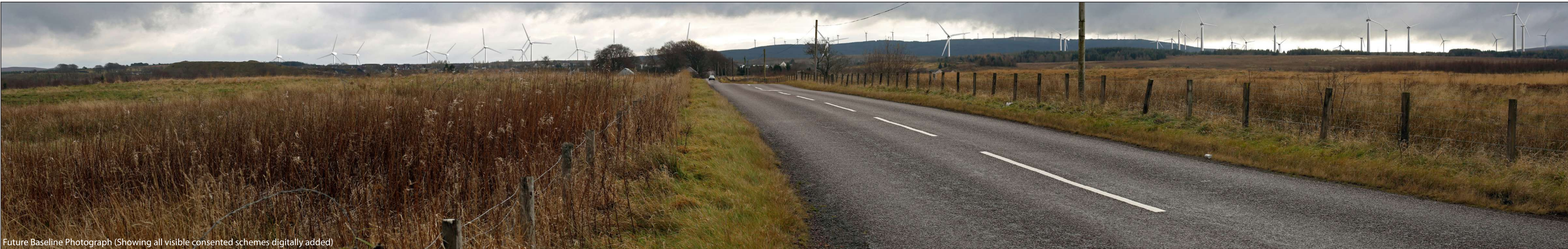
Future Baseline Photograph (Showing all visible consented schemes digitally added)