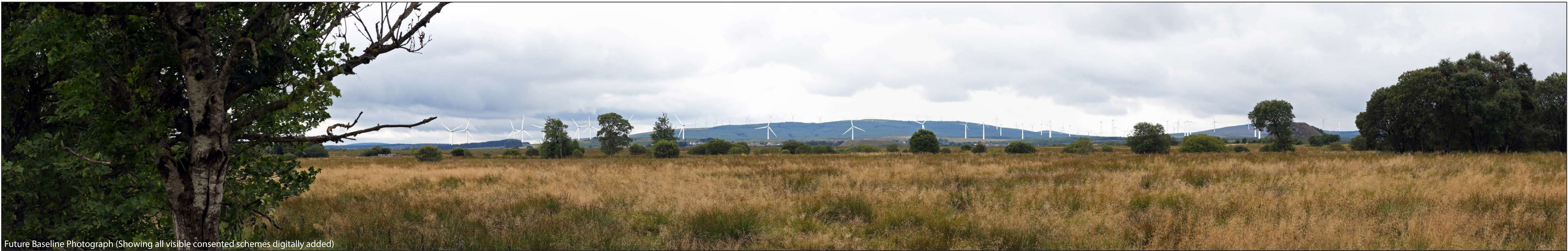
Future Baseline Photograph (Showing all visible consented schemes digitally added)