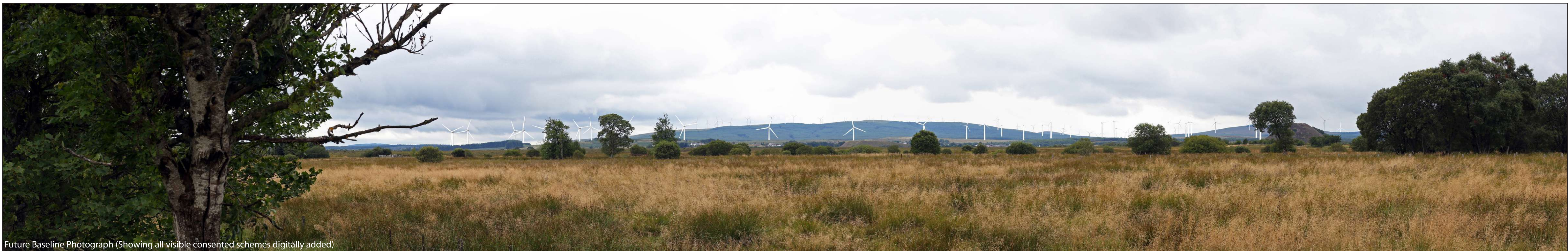
Future Baseline Photograph (Showing all visible consented schemes digitally added)