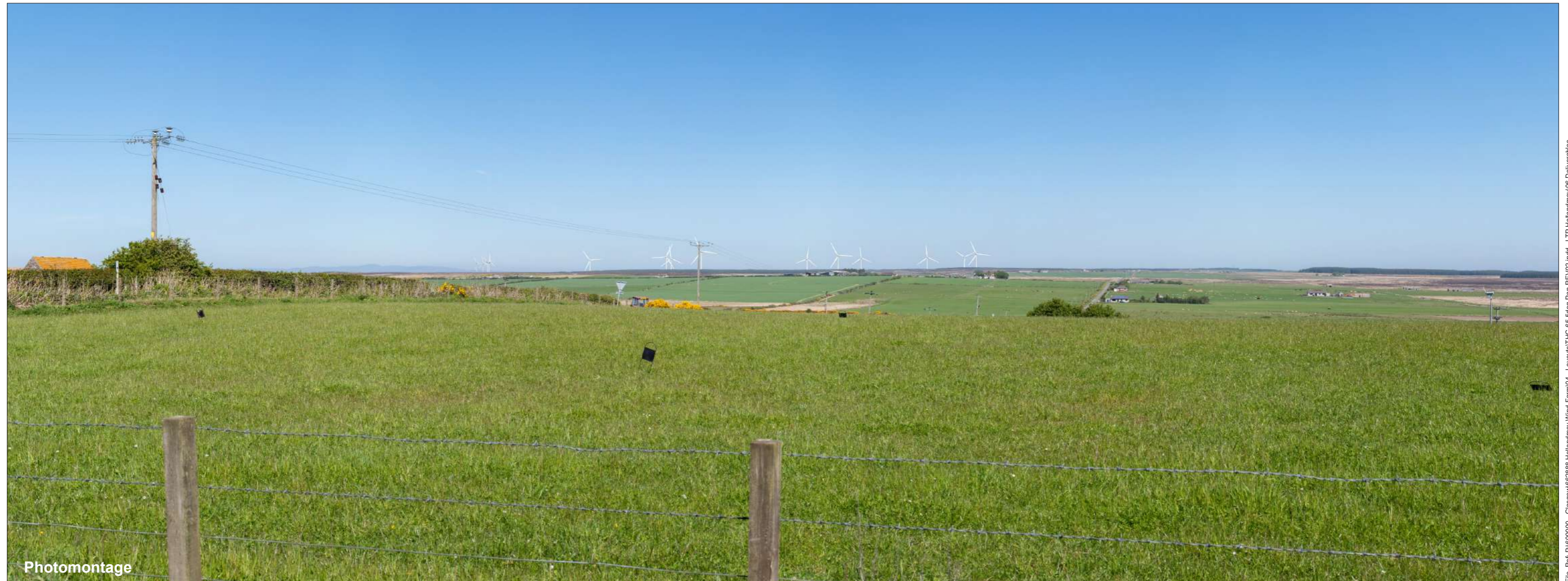
Figure: 7.26-THC-01 Viewpoint 13: Lyth Photomontage: Planar Projection