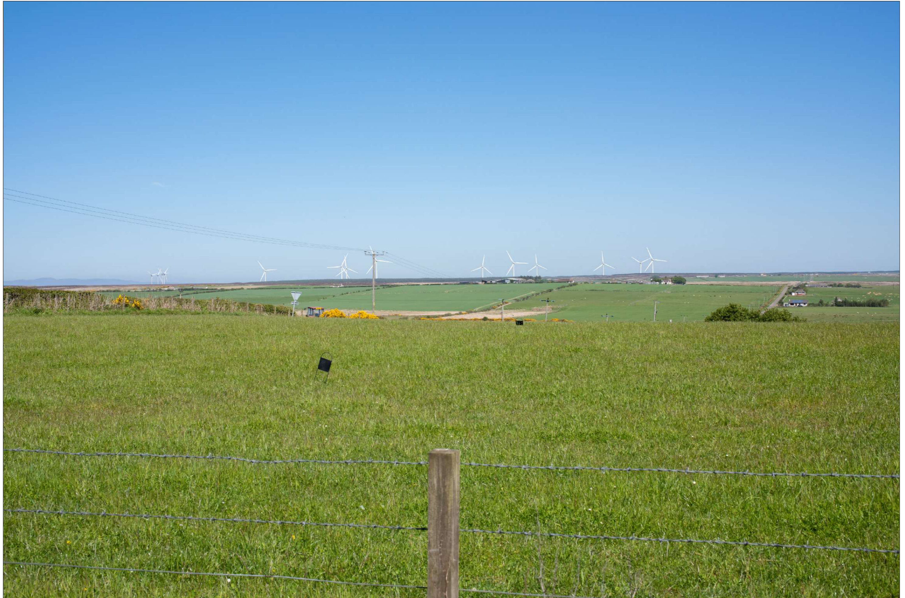
Figure: 7.26-THC-03 Viewpoint 13: Lyth

When viewed at a comfortable arm's length (approx. 500 mm), this printed image is representative of our detailed central vision, but is not representative of scale and distance.