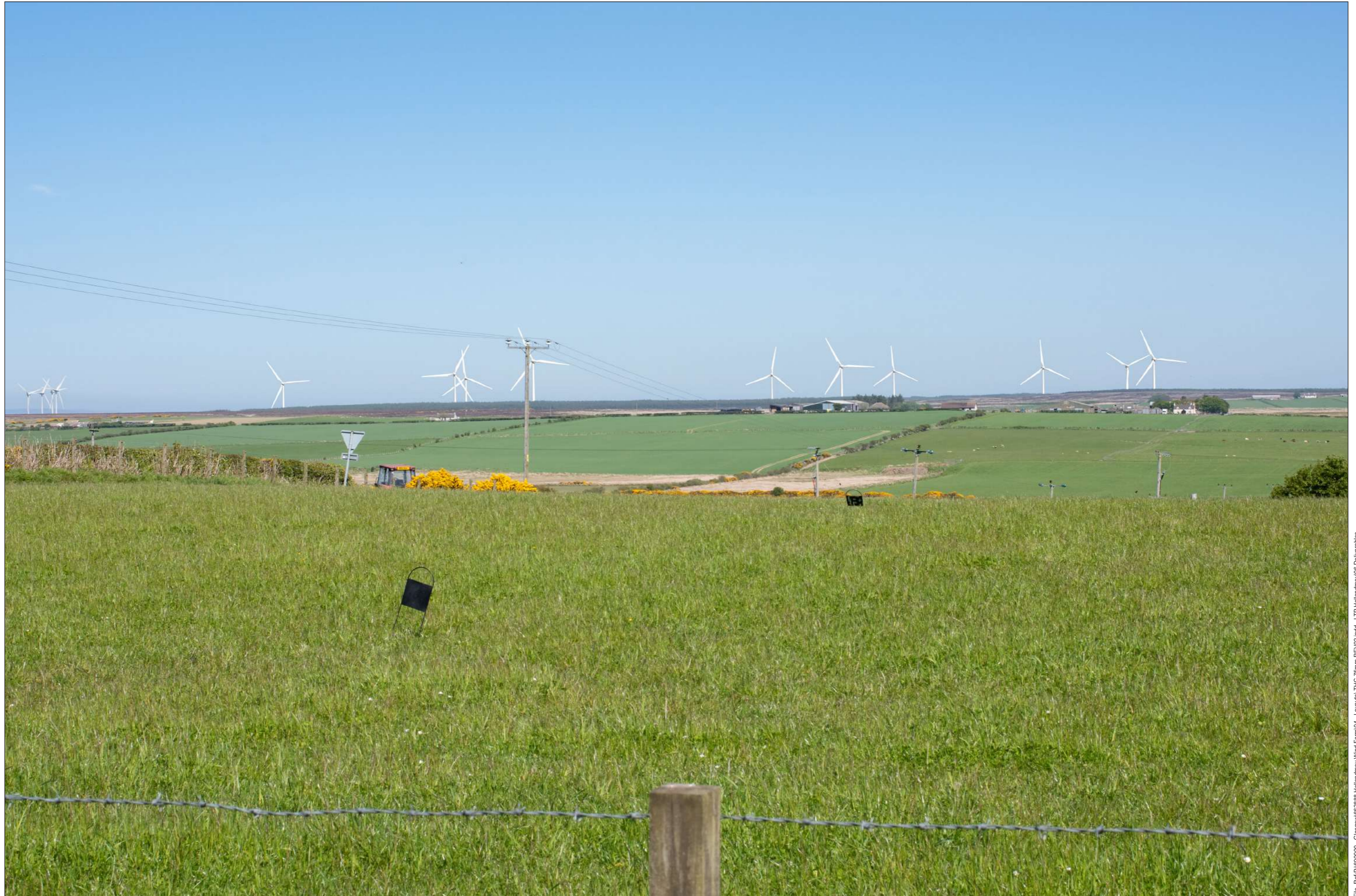
Figure: 7.26-THC-04 Viewpoint 13: Lyth

This image should be viewed at a comfortable arm's length (Approx. 500 mm)